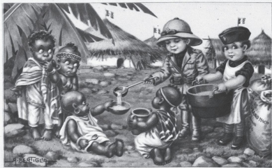
A postcard published in Italy in 1936 showing Italian and Abyssinian children in Abyssinia.