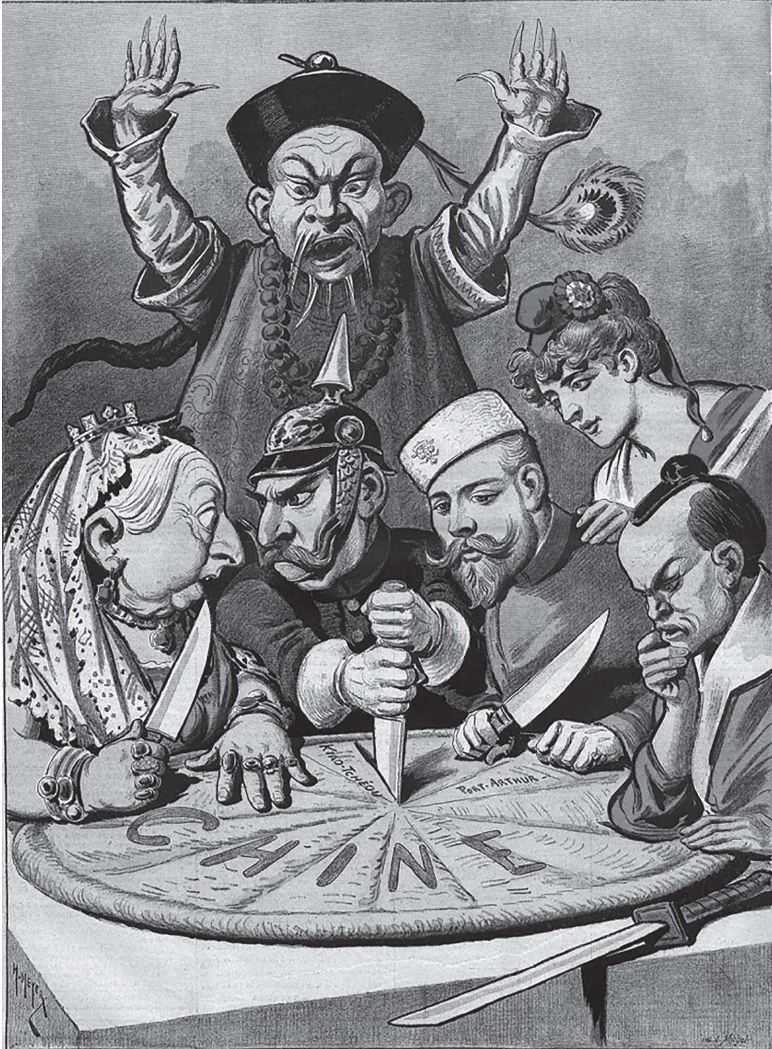
A cartoon published in a French magazine, 1898. The caption reads 'China – the cake of kings and of emperors'. The countries around the table are, from left to right, Britain, Germany, Russia, France and Japan.