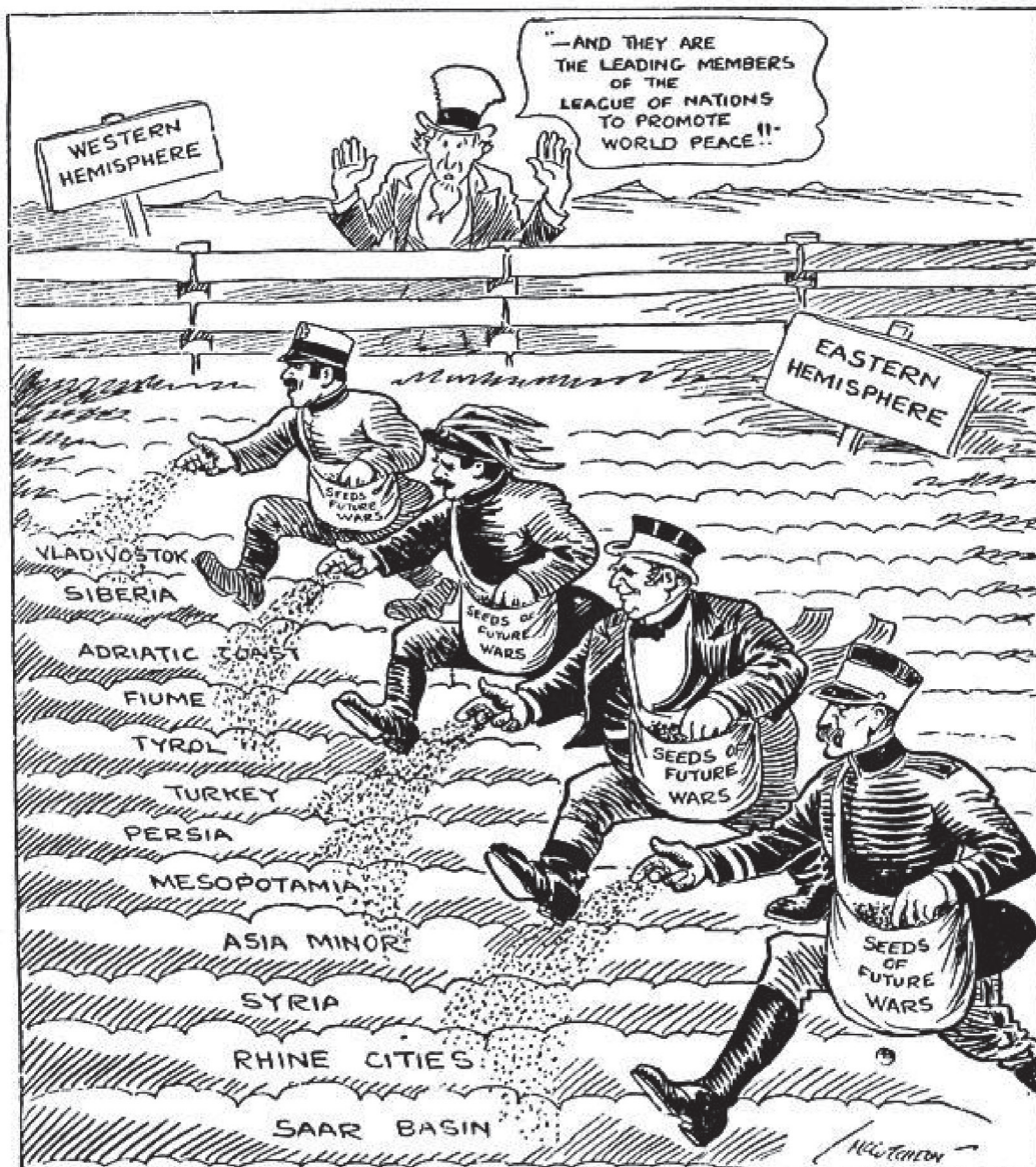
An American cartoon, 1920.