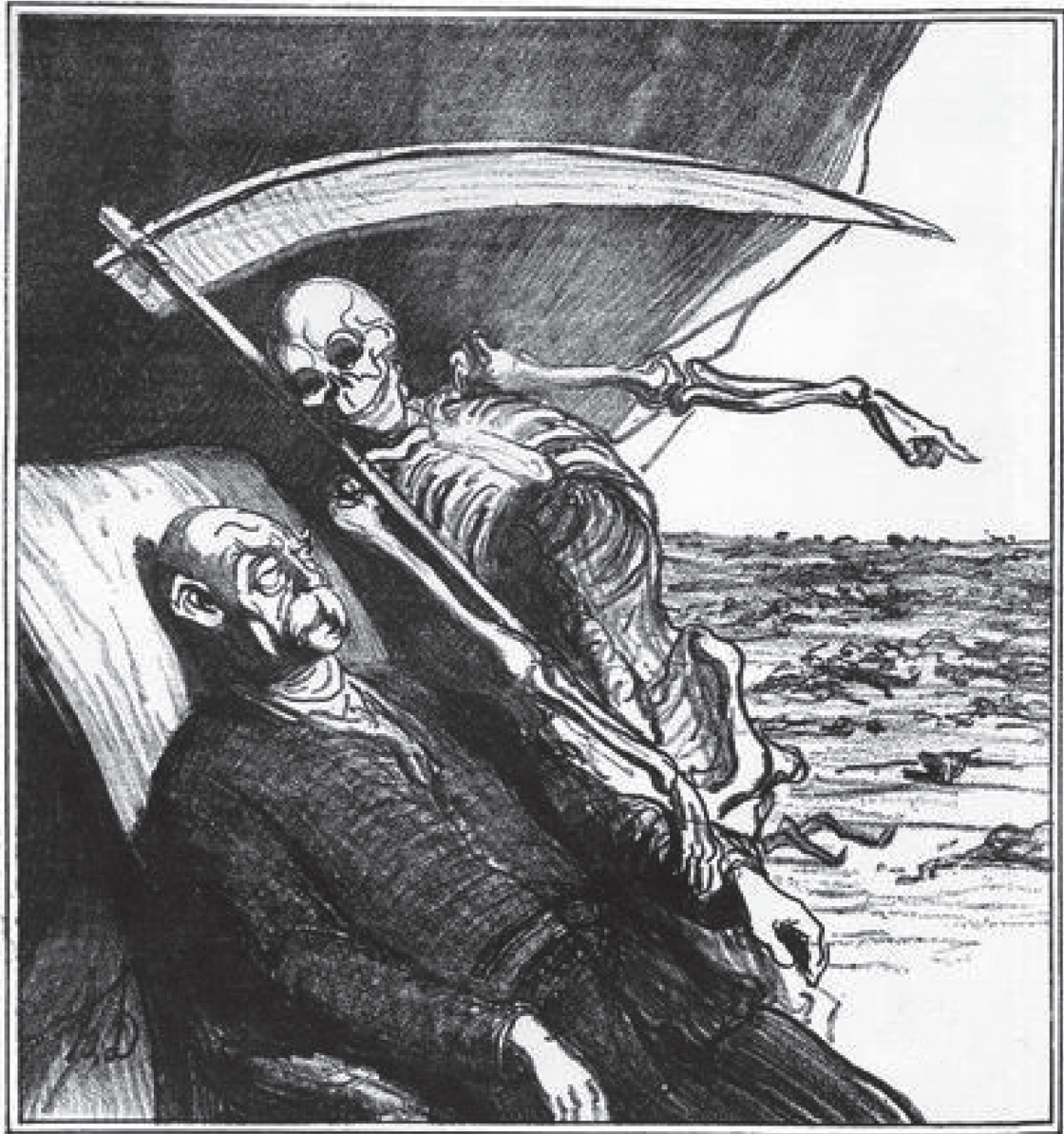
A cartoon published in France in August 1870 showing the war dead. The title of the cartoon is 'News'. The caption under the cartoon said, 'Bismarck's nightmare.' The Grim Reaper is saying, 'Thank you!...'