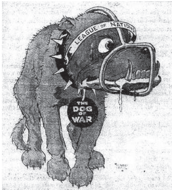
A British cartoon published in 1919.