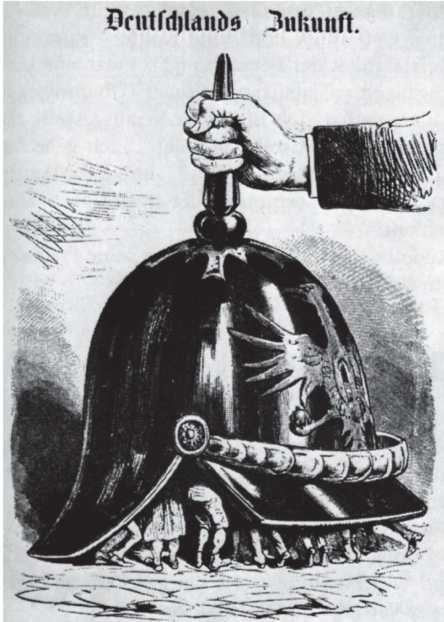
An Austrian cartoon, entitled 'Germany's Future', published in 1870. The caption was 'Will it fit under one hat? I believe it is more likely to come under a Prussian spiked helmet.'