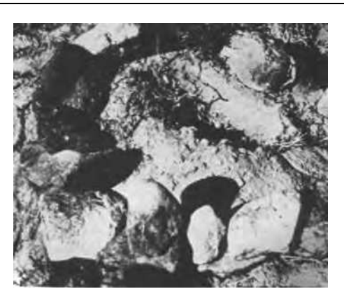
One of the four impressions found at the Socorro site.