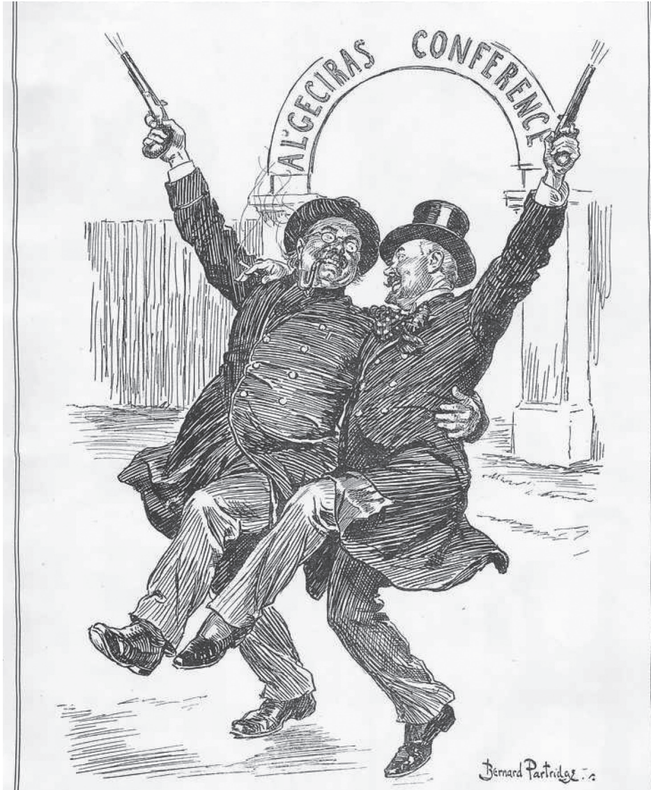
A British cartoon entitled 'Shots of Joy', published in April 1906. The caption to the cartoon read 'The Algeciras Conference has practically been concluded to the mutual satisfaction of the two rival powers whose differences at one time threatened to end in something worse than a diplomatic duel.'