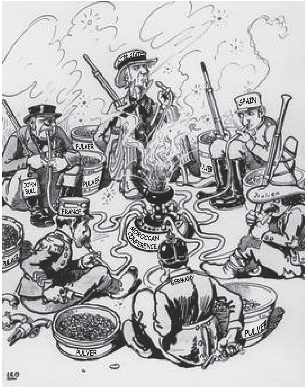
A German cartoon published in February 1906. The caption to the cartoon read 'At the Moroccan Conference: enthusiasm for smoking the peace pipe does not exclude the danger of a general explosion.' Pulver means gunpowder.