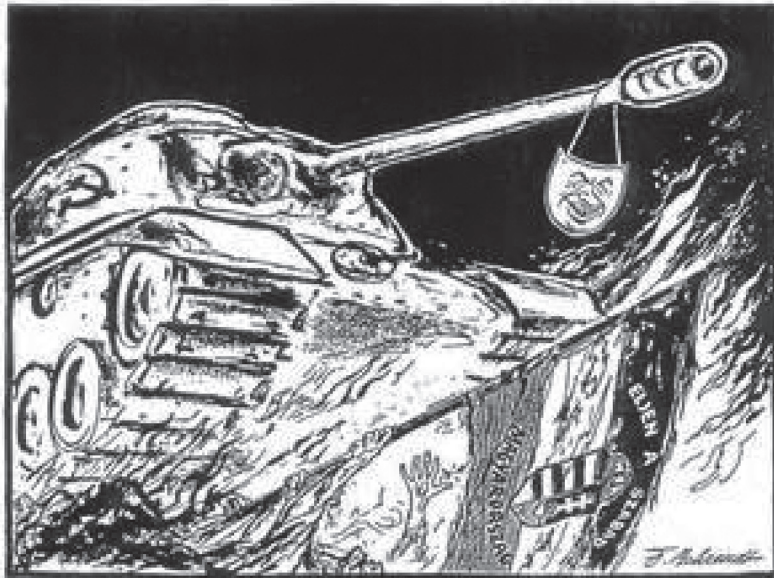
A Dutch cartoon published in November 1956. The caption read 'Peace and order are restored'.