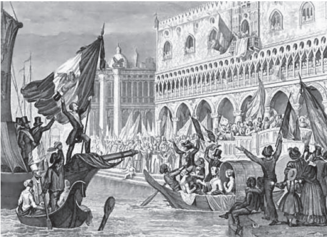
A drawing from the time of Daniele Manin proclaiming the Republic of Venice in 1848.