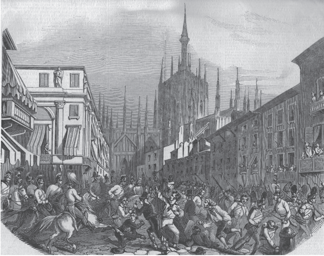
A drawing from the time of the uprising in Milan in March 1848.