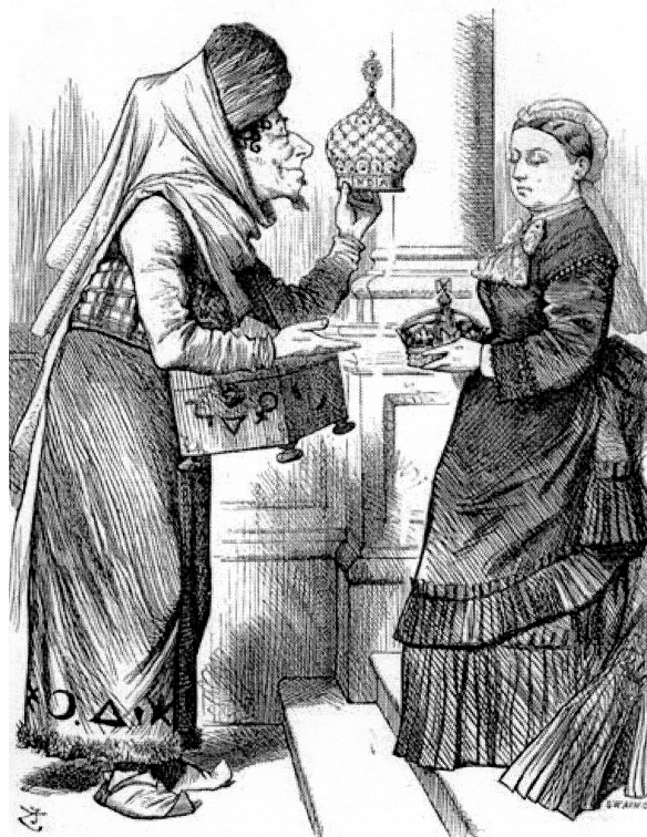
“NEW CROWNS FOR OLD ONES!”

25 Look at the cartoon, and then answer the questions which follow.