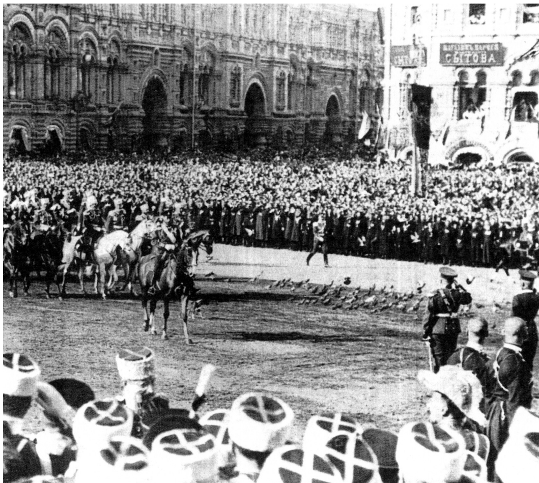
A photograph of Tsar Nicholas II at the 1913 celebrations of 300 years of Romanov rule. This was the first time since 1905 that he had appeared in public.

11 Look at the photograph, and then answer the questions which follow.