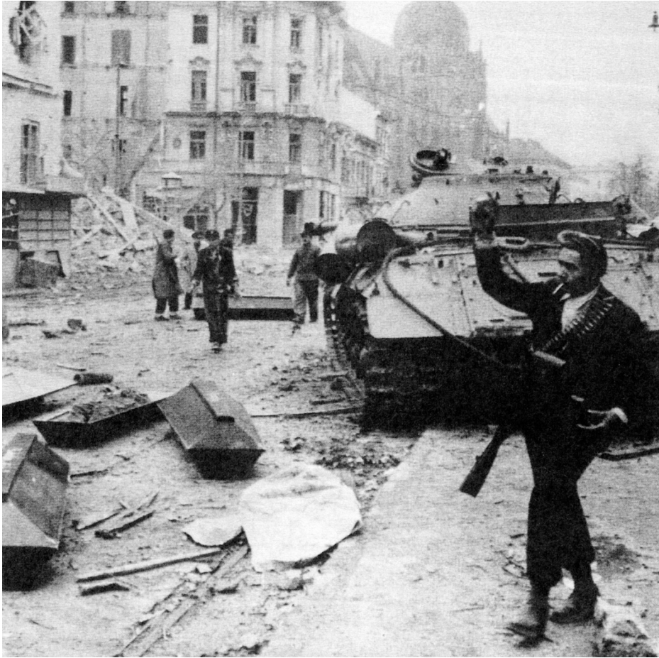
A photograph taken during the Soviet army's invasion of Hungary in 1956.

7 Look at the photograph, and then answer the questions which follow.