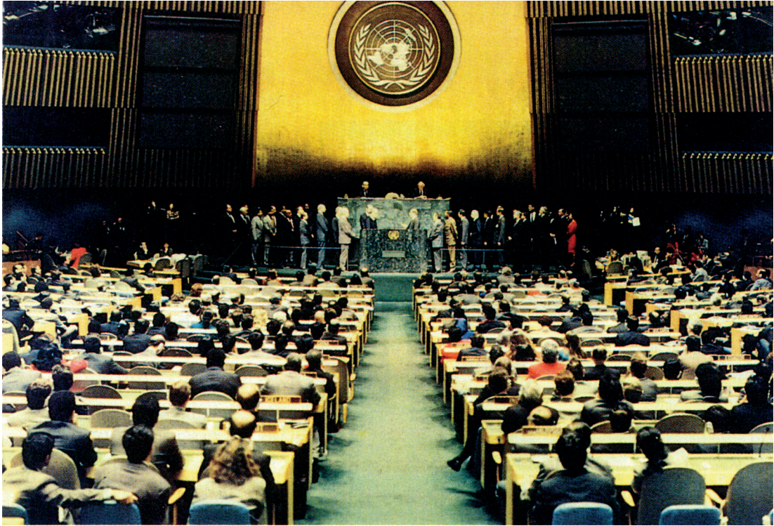
A photograph of the General Assembly of the United Nations in session.