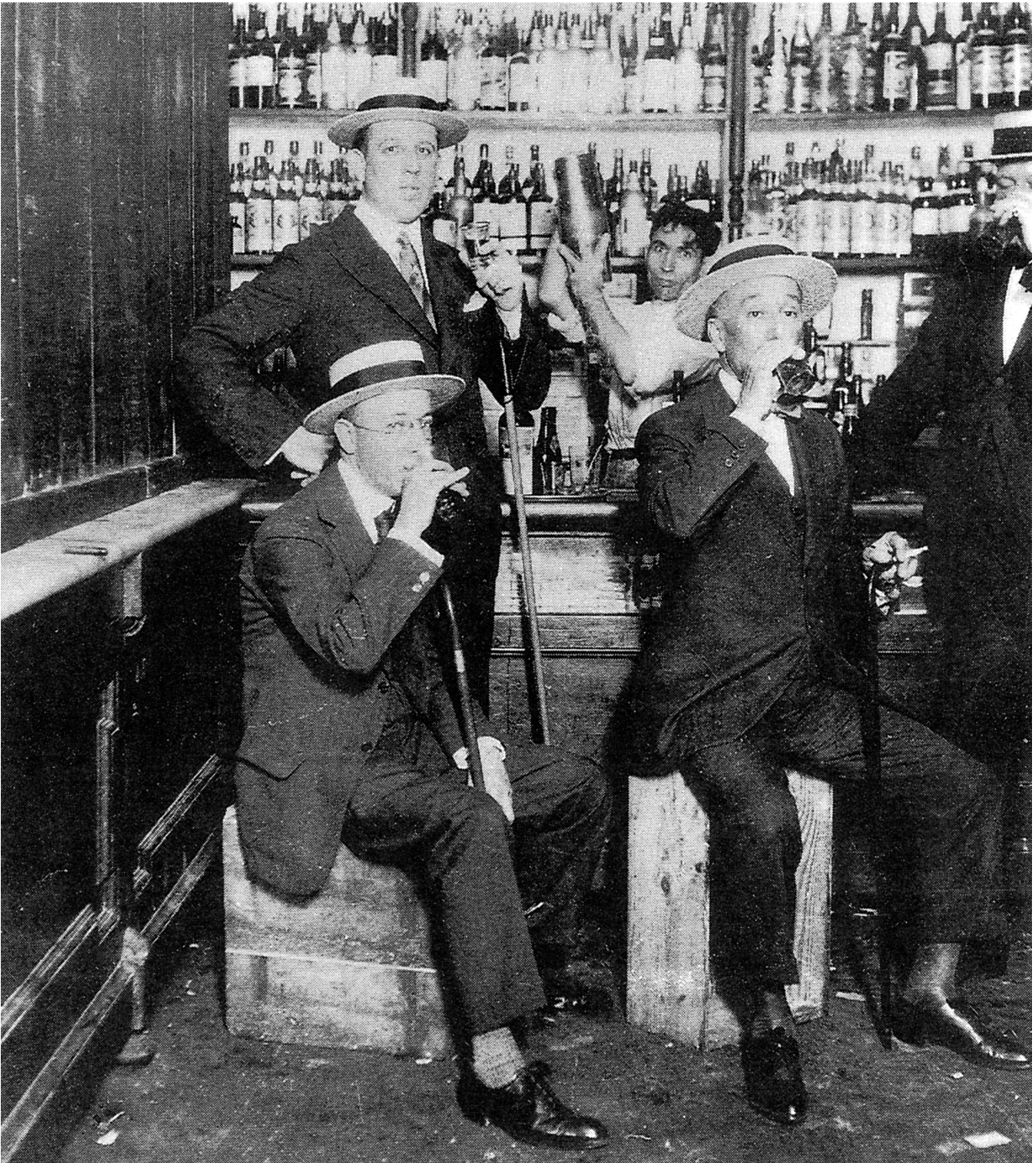
A photograph of a speakeasy.

13 Look at the photograph, and then answer the questions which follow.