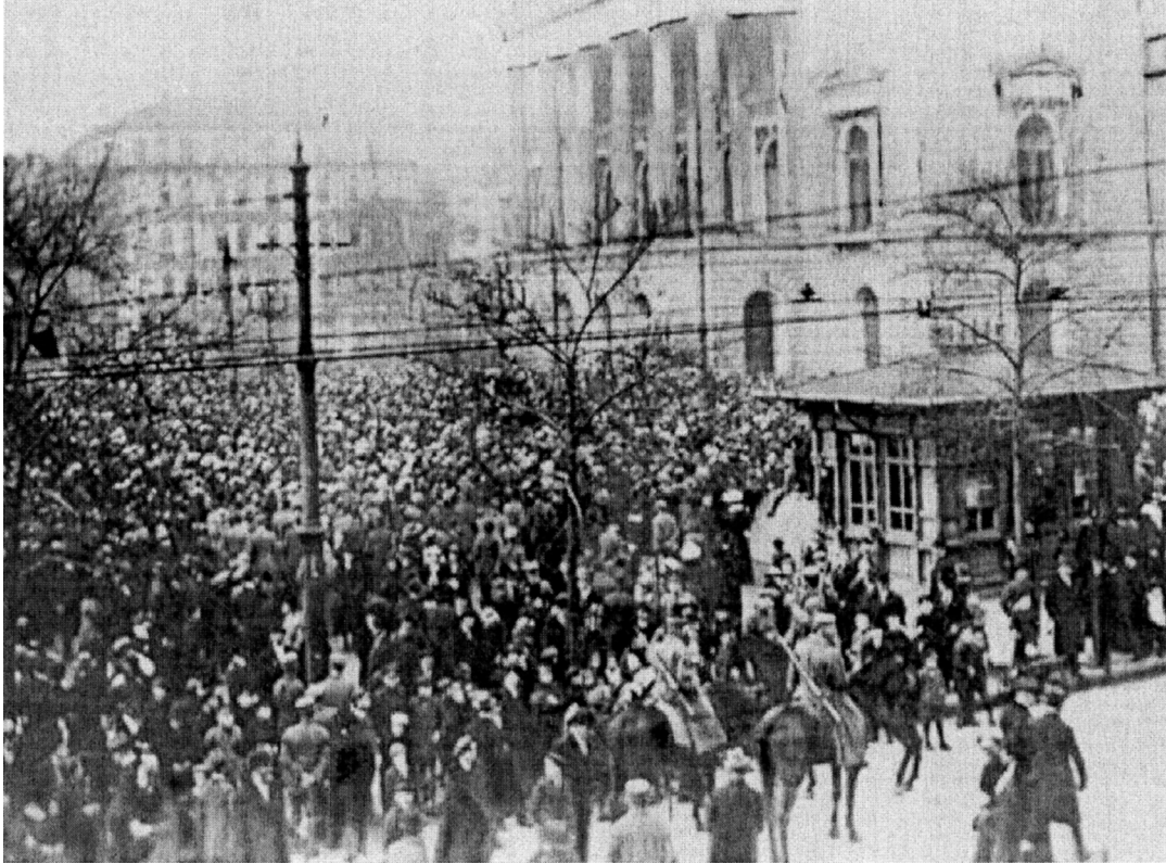
A photograph taken in Berlin in 1920 during the general strike.