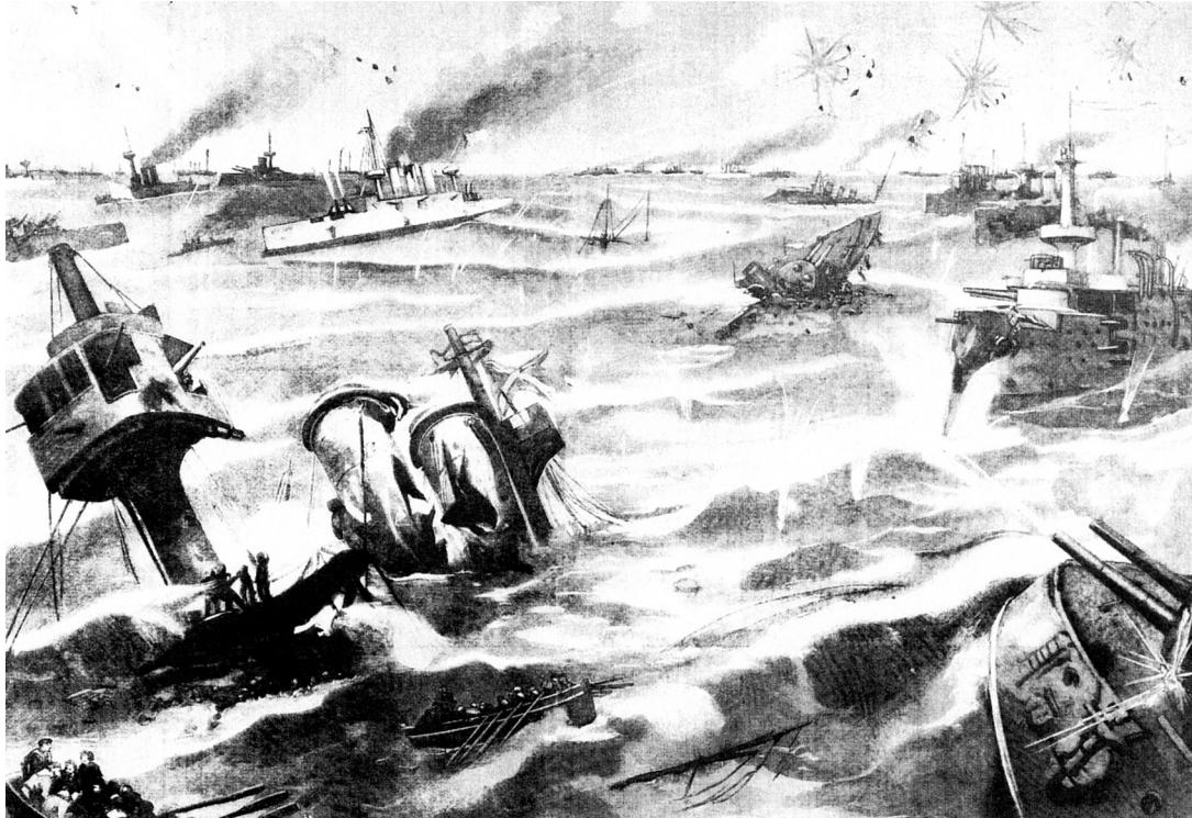
An illustration of the Battle of Tsushima Straits in which the Russian Baltic fleet was destroyed by the Japanese navy in May 1905.