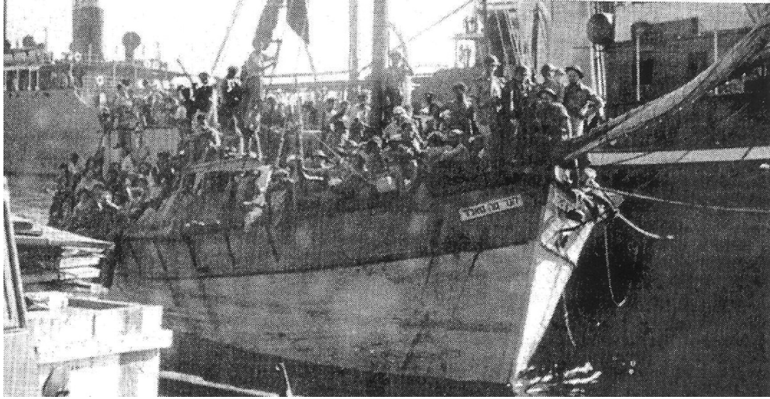
A refugee ship being sent back from Palestine to Cyprus by British soldiers in 1946.

20 Look at the photograph, and then answer the questions which follow.