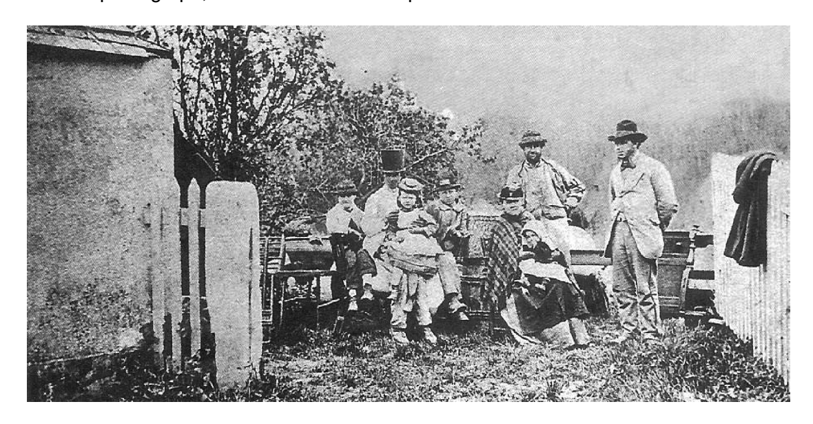
A photograph of a family of farm labourers taken in 1874. They have been evicted from their home. The labourers were members of the National Agricultural Labourers' Union.