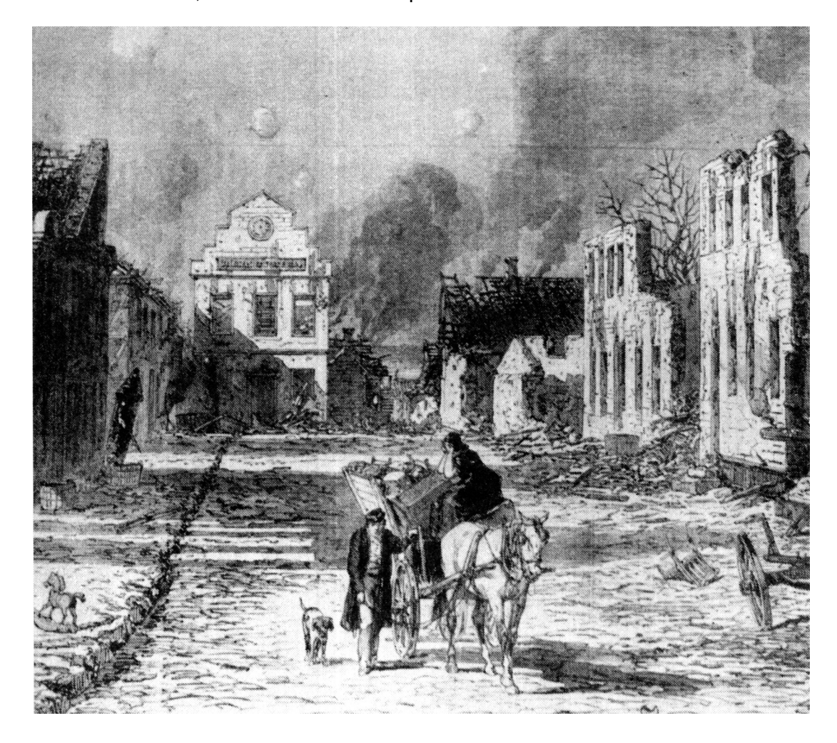
An illustration showing a Danish town in ruins after a bombardment by Prussian forces during the war of 1864.

2 Look at the illustration, and then answer the questions which follow.