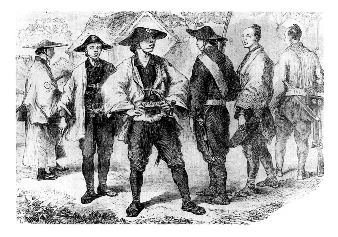
An illustration of Japanese soldiers in the 1860s in Western and traditional clothes.

4 Look at the illustration, and then answer the questions which follow.