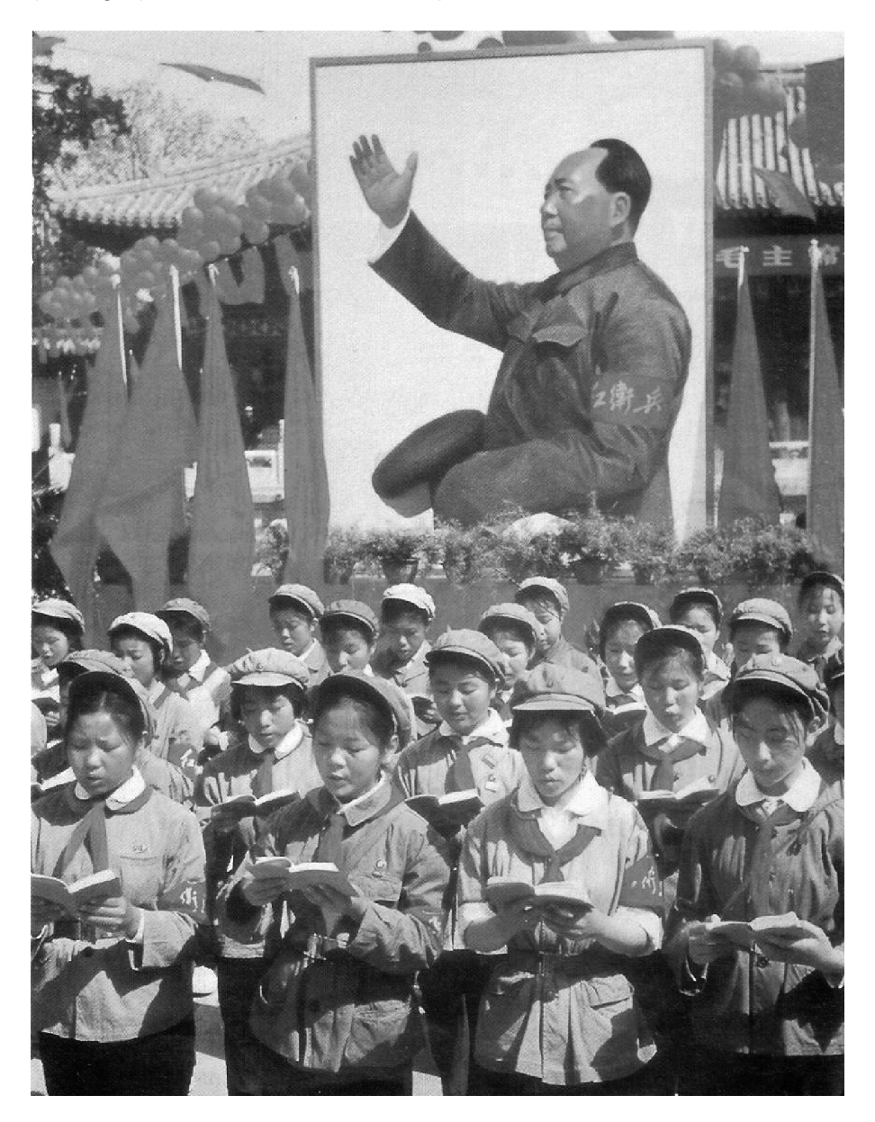
A photograph of Red Guards during the Cultural Revolution.