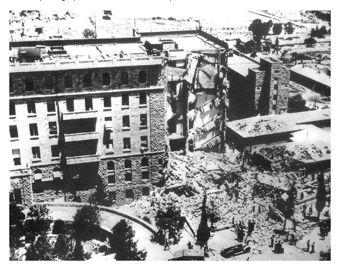
A photograph of the King David Hotel following the attack by Irgun members, July 1946.

20 Look at the photograph, and then answer the questions which follow.