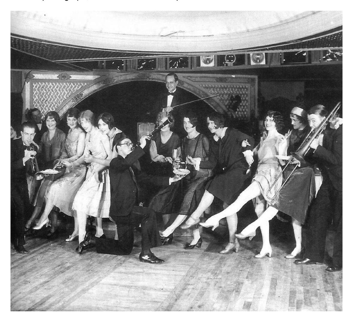
A photograph of young women dancing in 1920s America.

13 Look at the photograph, and then answer the questions which follow.