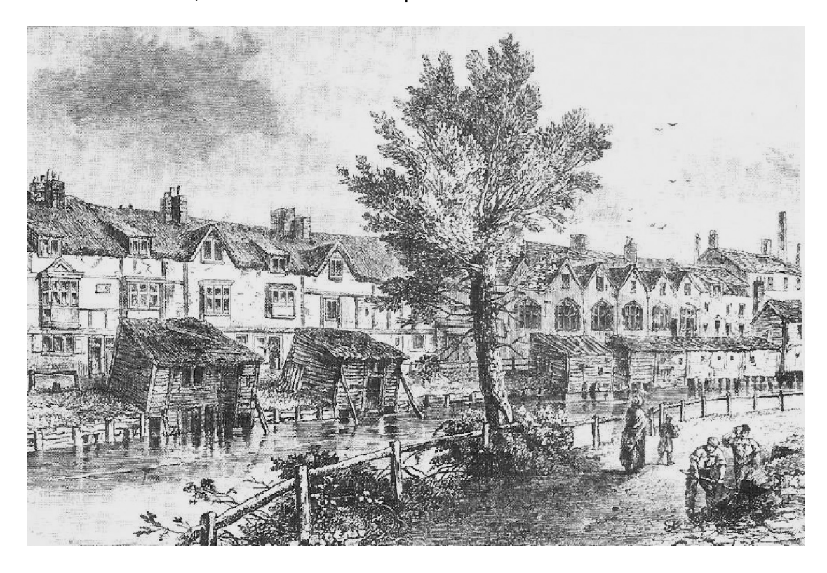
An illustration of housing in Bermondsey, London, in the mid-nineteenth century.

22 Look at the illustration, and then answer the questions which follow.