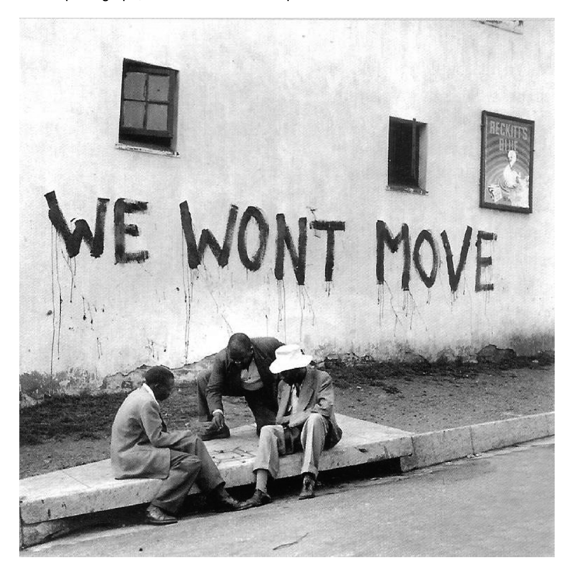
A photograph of the outside of a house in Sophiatown, 1955.

17 Look at the photograph, and then answer the questions which follow.