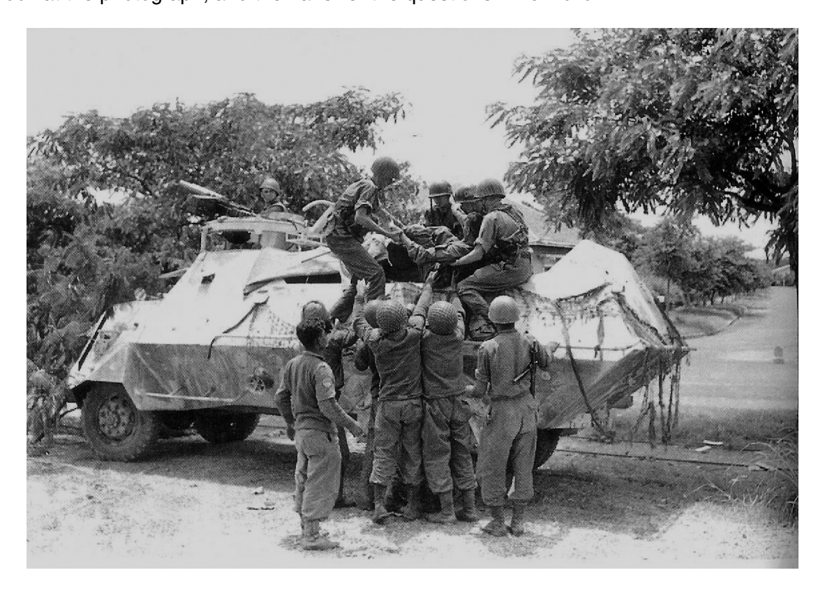
A photograph of a wounded soldier being lifted from a UN vehicle in the Congo in 1960.