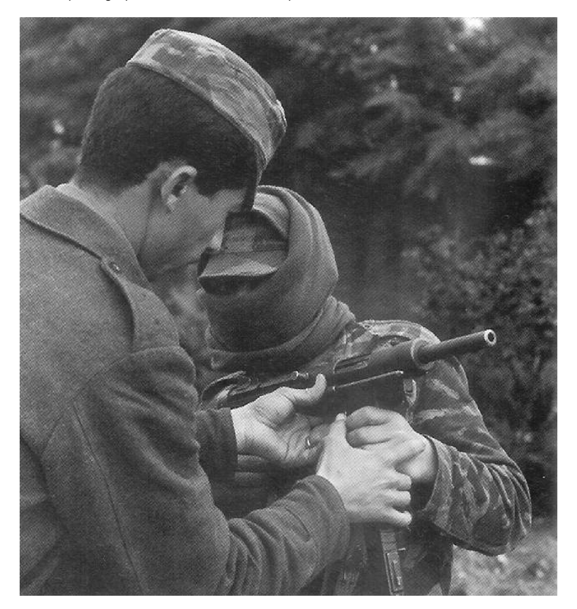
A young Fatah member receiving military training in 1966.