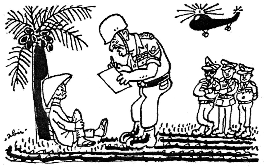
'If there's a general election tomorrow, which General would you vote for?'