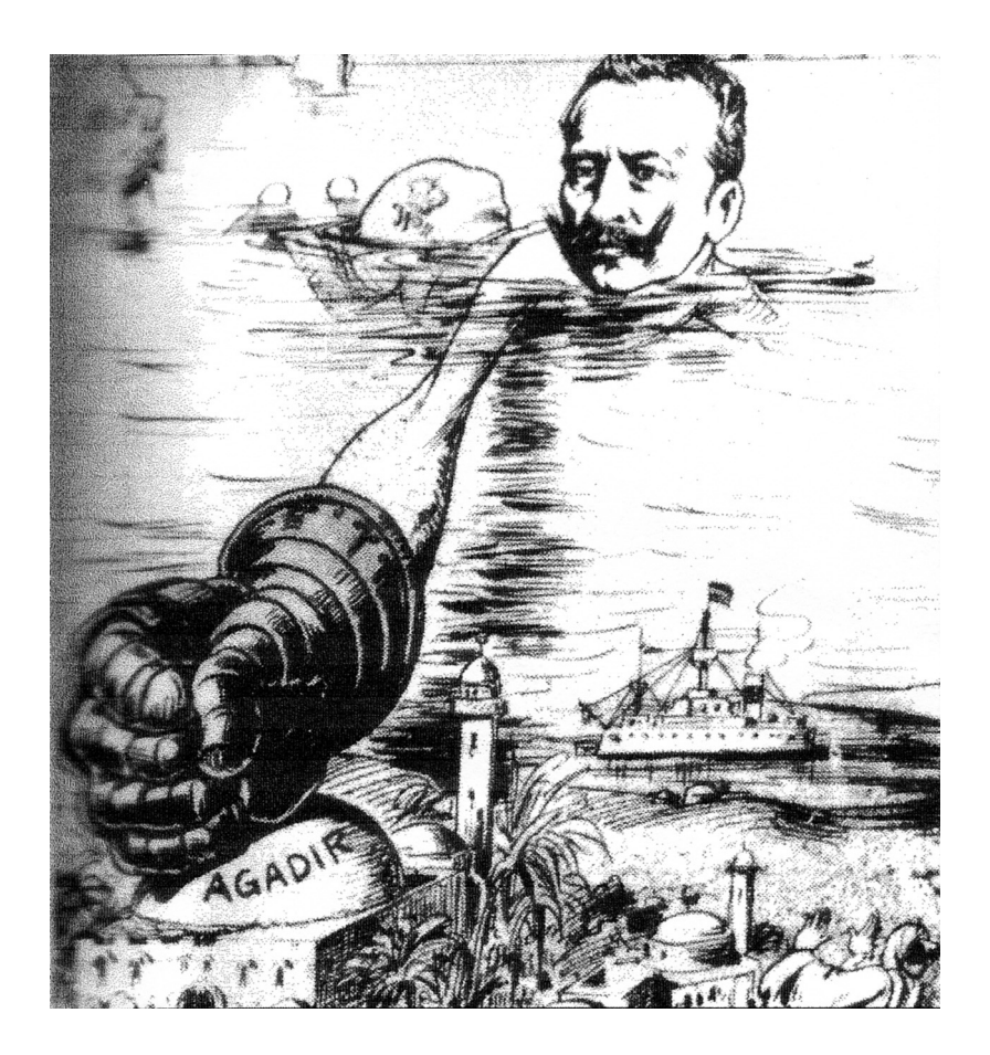
A cartoon published in Germany during the crisis. The figure is William II.