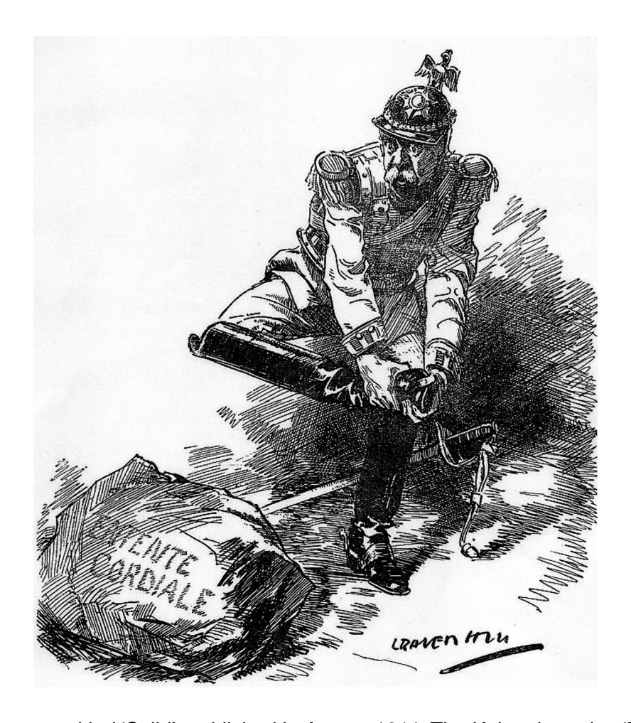
A British cartoon, entitled 'Solid', published in August 1911. The Kaiser is saying 'Donnerwetter! It's rock. I thought it was going to be paper.'