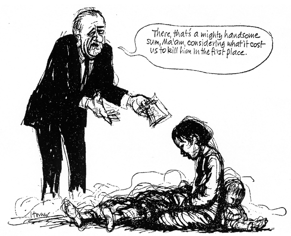
(The US is spending more than $40,000,000 per day on the war in Vietnam; compensation payments for South Vietnamese civilians killed 'by mistake' are $34 per head.)