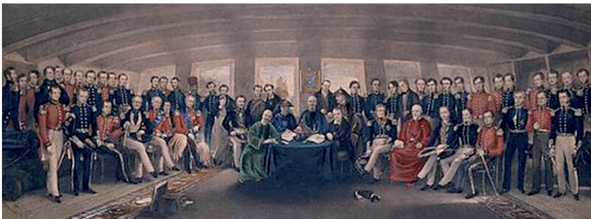
The signing of the Treaty of Nanking in August 1842. It marked the end of the First Opium War in which China suffered military defeat.

24 Look at the picture, and then answer the questions which follow.