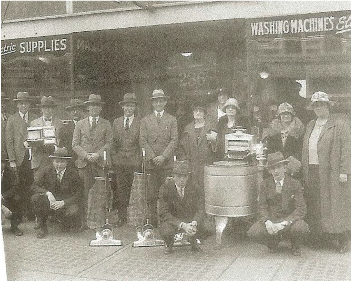
A photograph of sales staff taken in the early 1920s.

13 Look at the photograph, and then answer the questions which follow.