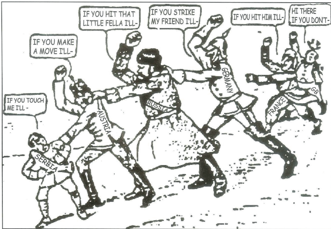
An American cartoon entitled 'The Chain of Friendship'. It was published in July 1914.