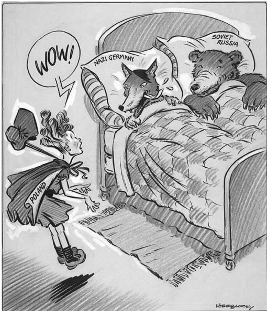
A cartoon published in America in September 1939.