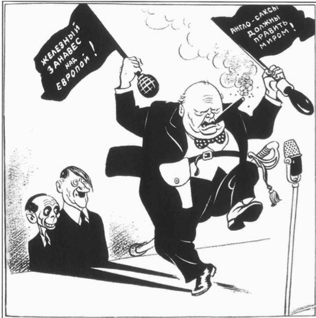
A cartoon entitled 'Churchill and His Predecessors' published in a Soviet magazine, March 1946. The flags read 'Iron Curtain Over Europe' and 'The English Should Rule the World.'