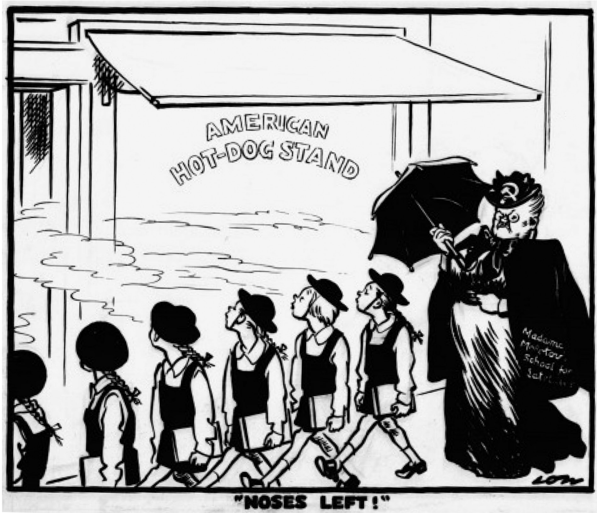
A cartoon published in Britain, July 1947. The figure on the right represents Molotov, who was in charge of foreign policy in the Soviet government. The writing on his dress says 'Madam Molotov's School for Satellites'. A hot-dog is an American snack.