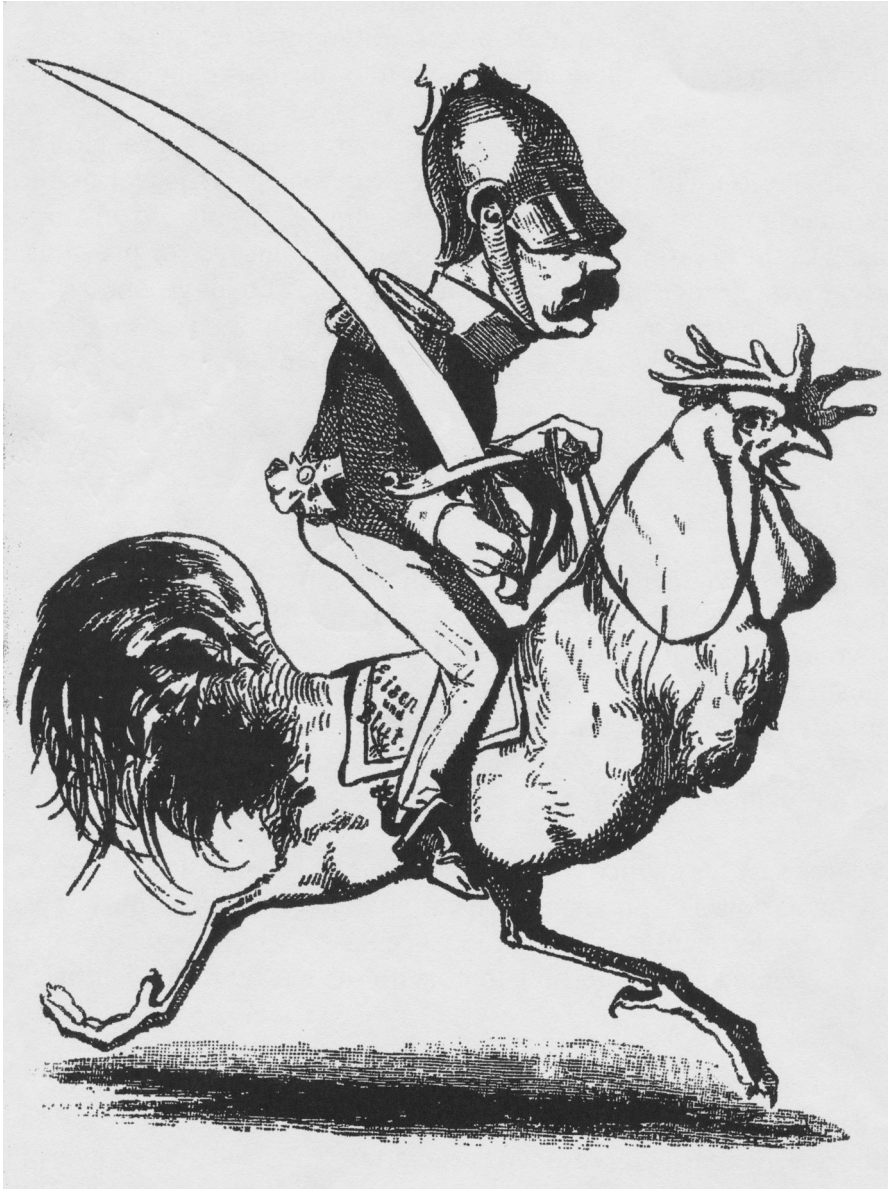
A cartoon, entitled 'The New Blücher', published in the free city of Frankfurt, 1863. Frankfurt supported Austria in the war of 1866. The cartoon shows Bismarck riding a cockerel which represents France. Blücher led the Prussian army in the defeat of Napoleon I at Waterloo in 1815. On the saddle is written 'Iron and Blood'.