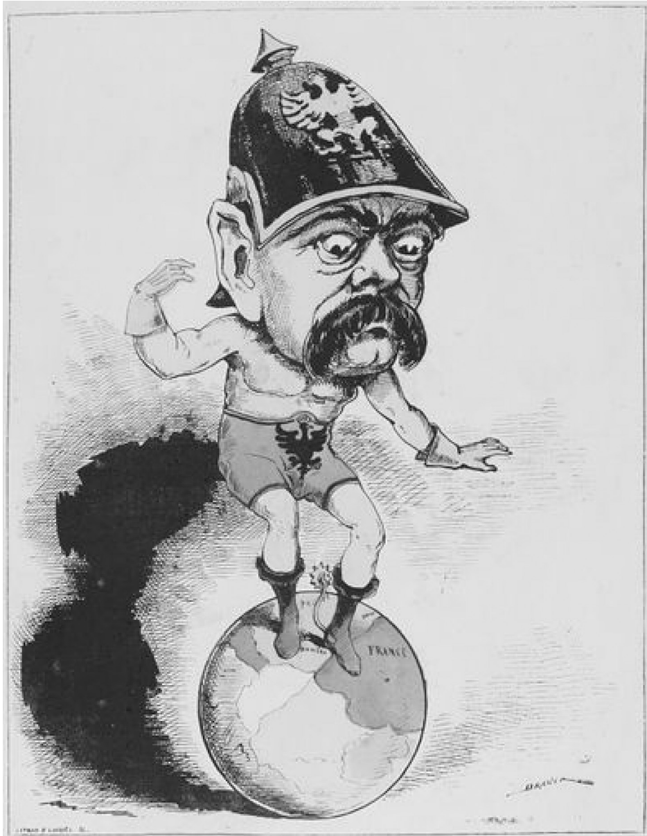
A cartoon published in France, 1870. The title of the cartoon is 'The Man on the Ball'. Bismarck's left foot is on France.