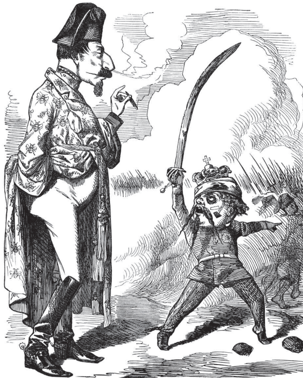
THE GIANT AND THE DWARF.

A cartoon published in Britain in June 1859. Napoleon III, on the left, is saying to King Victor Emmanuel, 'Bravo, my little fellow! You shall do all the fighting and we'll divide the glory.'