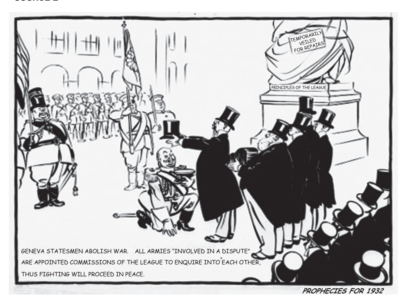
A British cartoon published in December 1931.