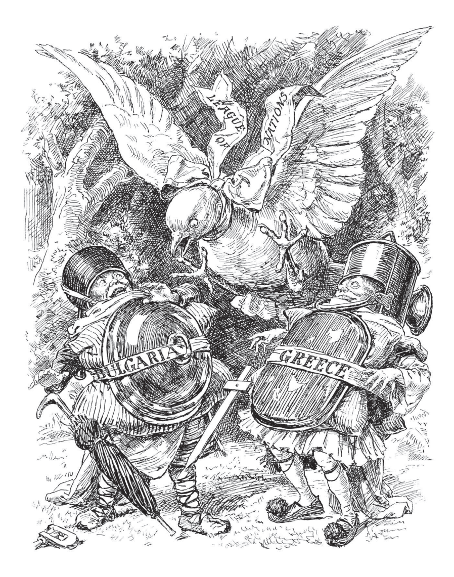
"JUST THEN CAME DOWN A MONSTROUS DOVE WHOSE FORCE WAS PURELY MORAL, WHICH TURNED THE HEROES' HEARTS TO LOVE AND MADE THEM DROP THEIR QUARREL."

A British cartoon published in November 1925.