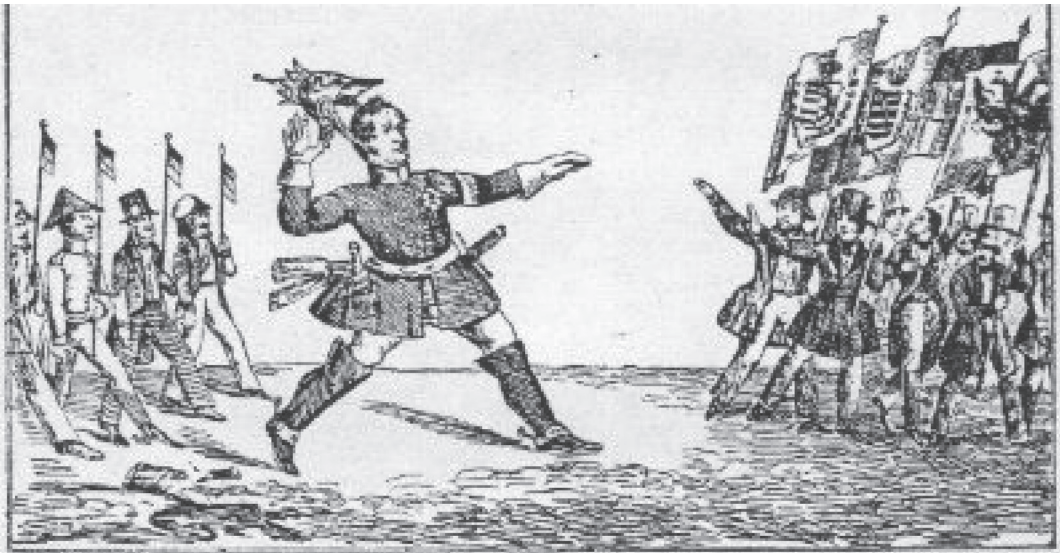
A cartoon published in Germany, March 1848. King Frederick William IV is saying to the revolutionaries, 'You up ahead! Hurry to me because I want to lead the movement.'