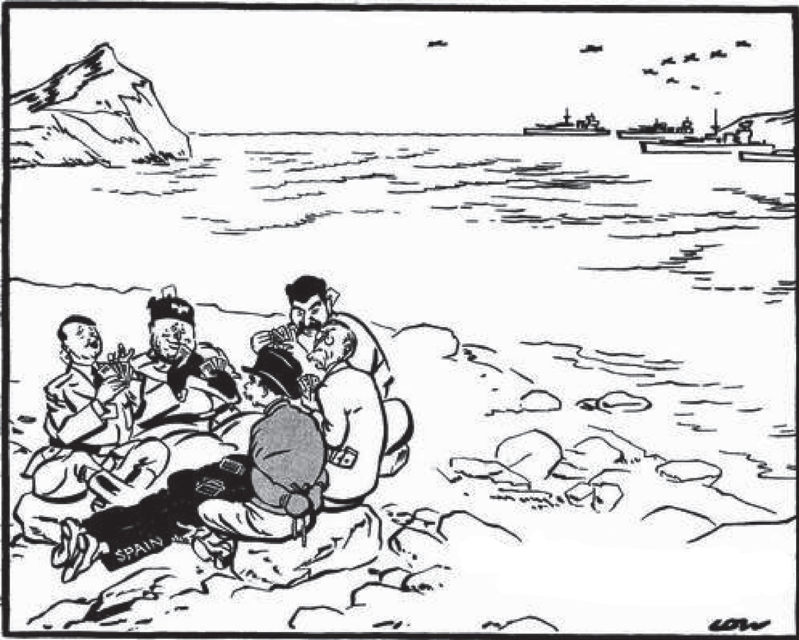
A British cartoon published in January 1937. On the left are Hitler, Mussolini, Stalin, Blum and Eden (a leading member of the British government) playing cards. 'Trustful Tony' (Eden) is saying, 'Just to discourage cheating, I'll wear a strait-jacket and let you chaps play my cards.' In the top left is the rock of Gibraltar.