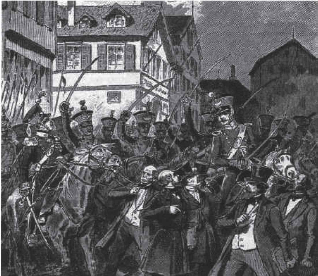
A drawing, from the time, of the Württemberg army and the last members of the Frankfurt Parliament in Stuttgart in June 1849.