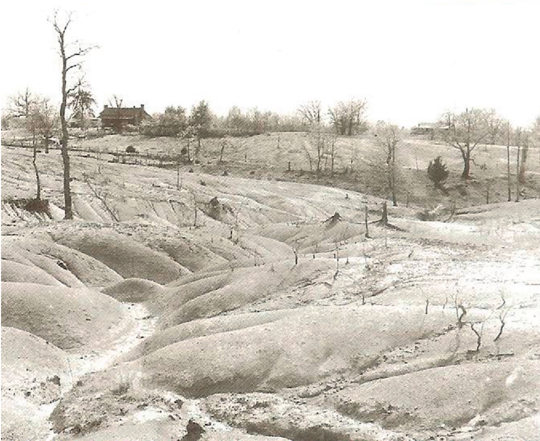
A photograph showing the effects of erosion in the Tennessee Valley.

14 Look at the photograph, and then answer the questions which follow.