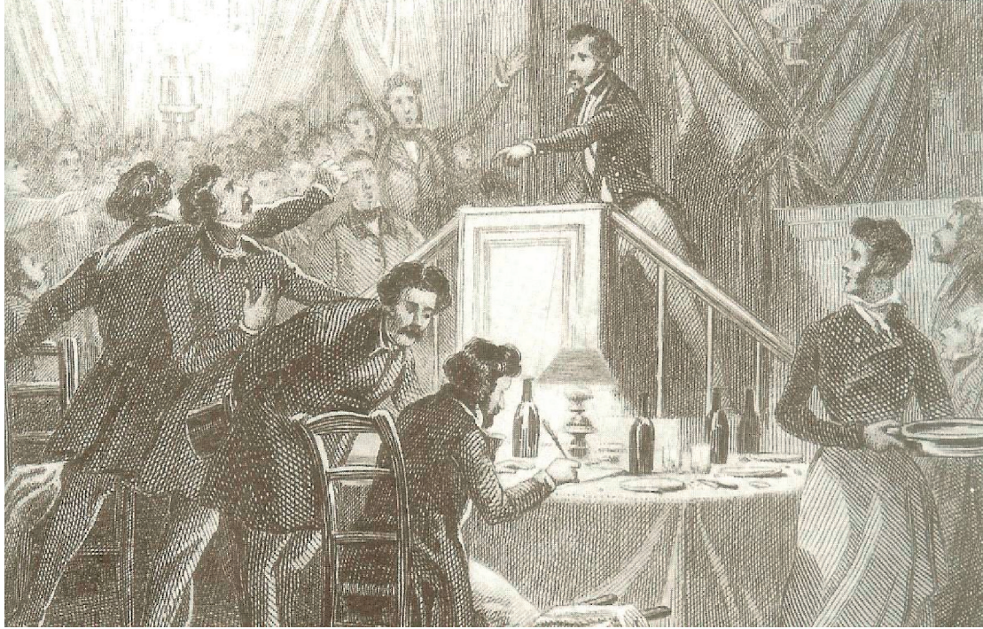
An illustration of a reform banquet held in Paris in 1847.