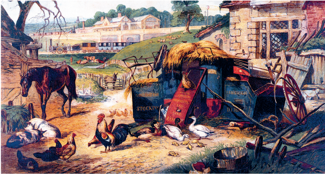
A painting of a country scene produced around 1845.

22 Look at the painting, and then answer the questions which follow.