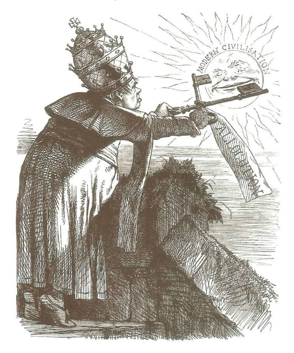
Papal Allocution.—Snuffing out Modern Civilisation.

2 Look at the cartoon, and then answer the questions which follow.