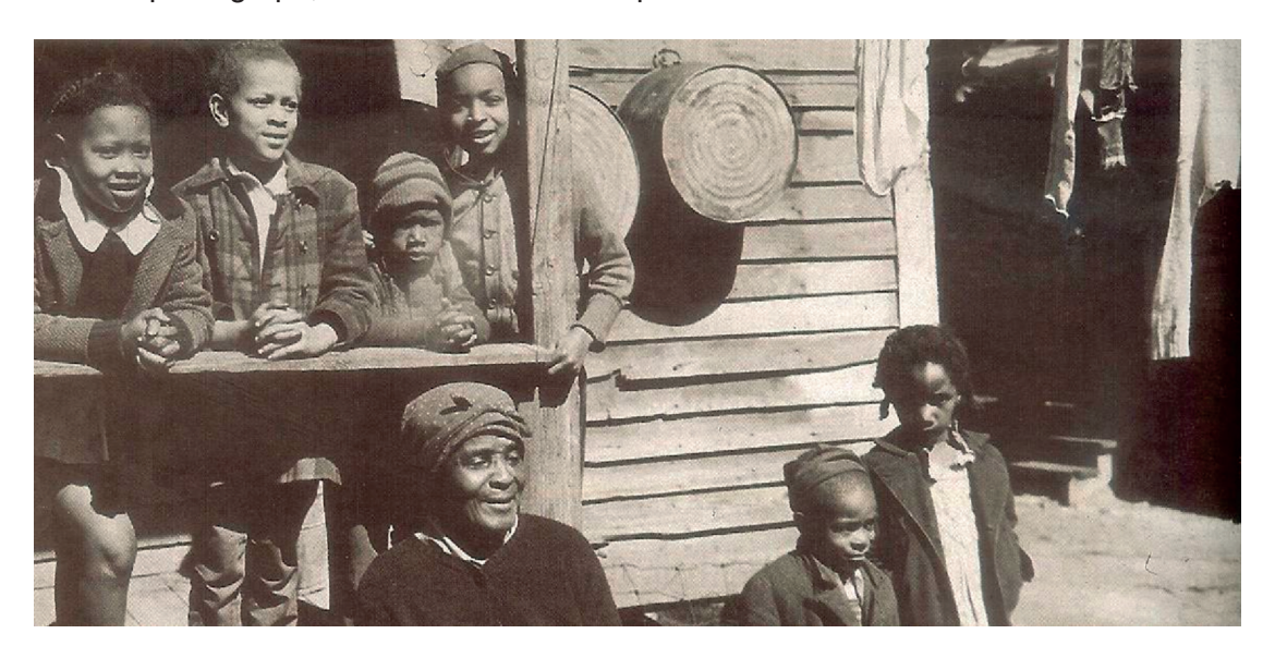
A photograph of a black family at home in the southern state of Virginia, during the 1920s.

13 Look at the photograph, and then answer the questions which follow.