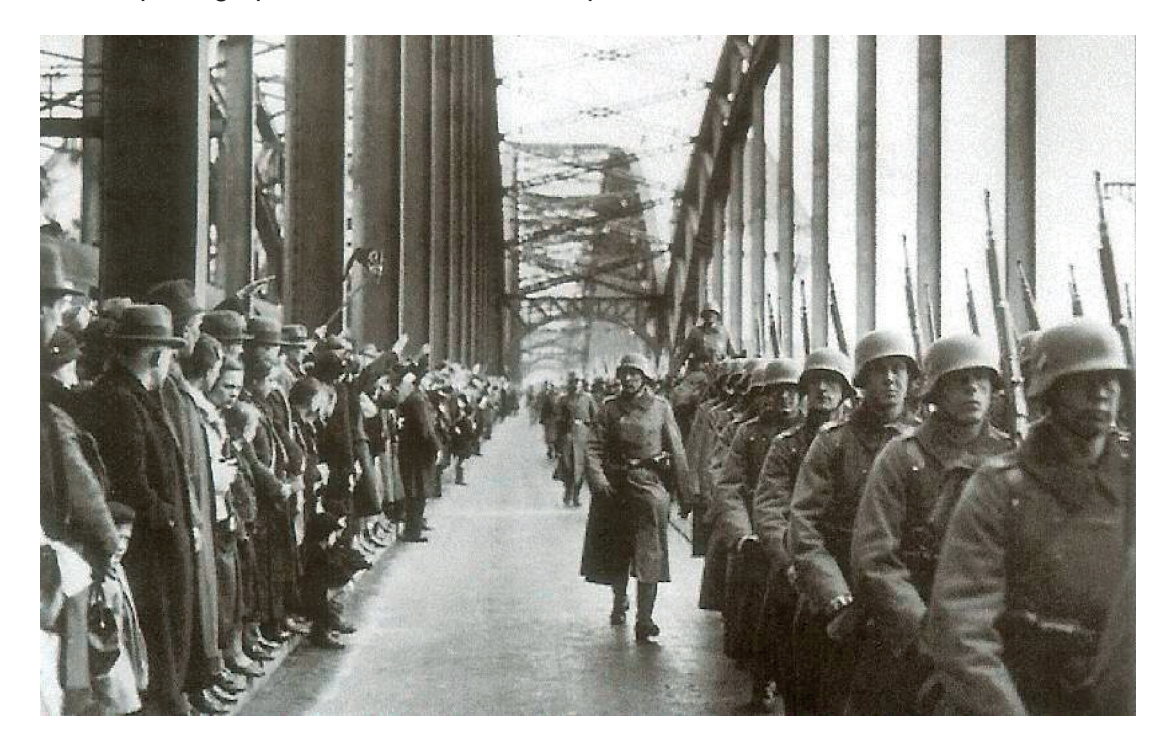
A photograph of German forces crossing the Cologne Bridge to enter the Rhineland in 1936.

6 Look at the photograph, and then answer the questions which follow.