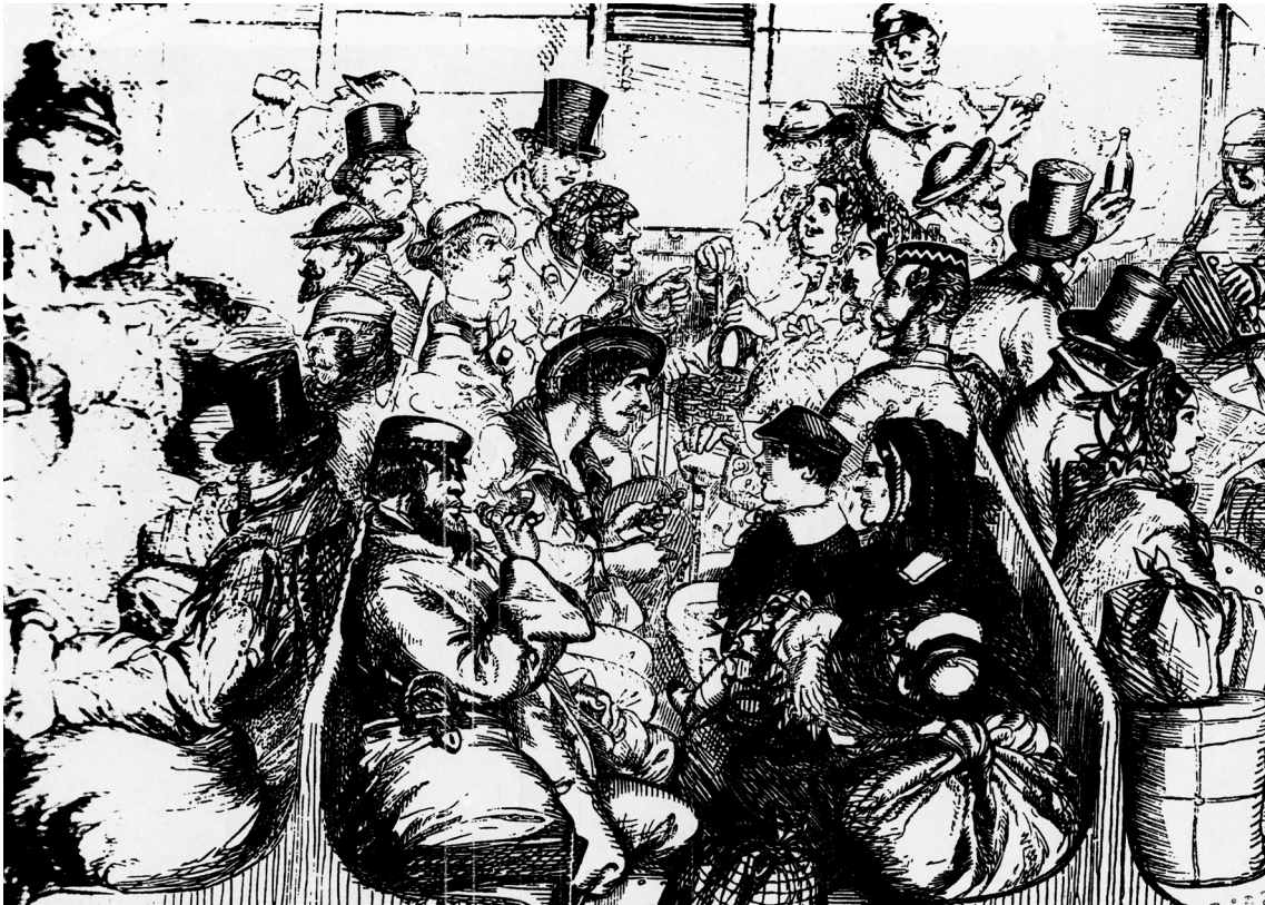
Sketch made in 1859 of a Parliamentary train from London to the Midlands.