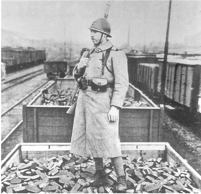
A photograph of a French soldier guarding a train in the Ruhr, 1923.