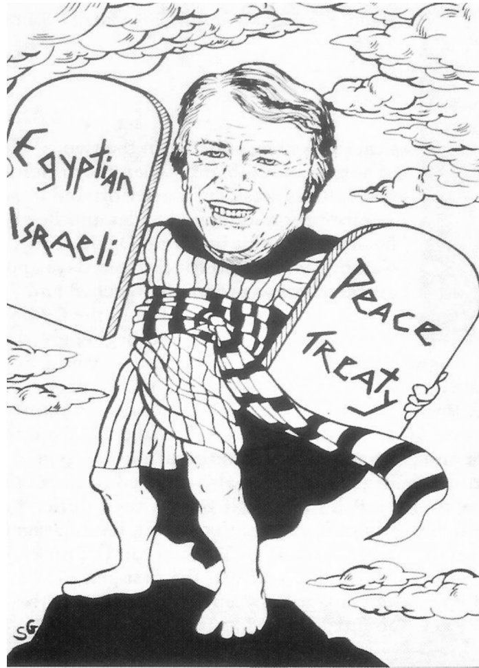
An American cartoon, showing President Carter, published in 1978.

20 Look at the cartoon, and then answer the questions which follow.