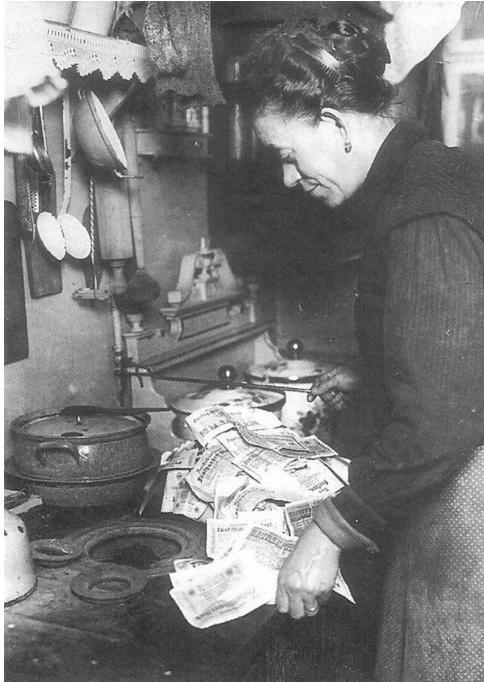
A photograph taken in 1923 showing a German housewife using paper money to light her kitchen stove.