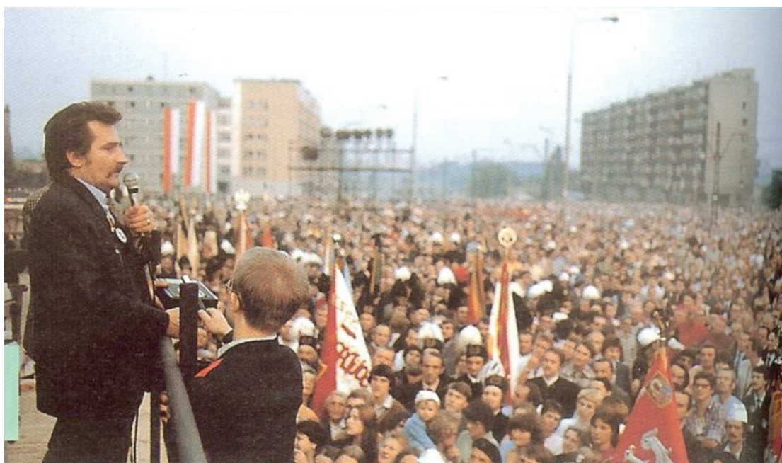
A photograph of Lech Walesa, the 'Solidarity' leader, speaking at Gdansk in 1980.

8 Look at the photograph, and then answer the questions which follow.