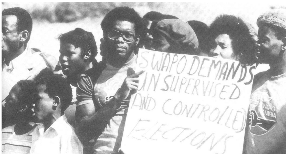
A photograph of a SWAPO protest in 1978.

19 Look at the photograph, and then answer the questions which follow.