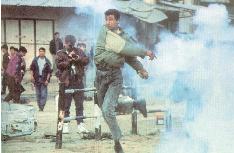
A photograph of a Palestinian protester in Hebron.

21 Look at the photograph, and then answer the questions which follow.