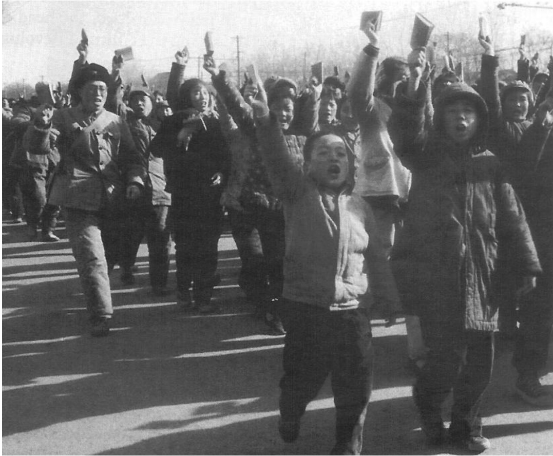
A photograph of Red Guards on the streets of Beijing during the Cultural Revolution.

16 Look at the photograph, and then answer the questions which follow.