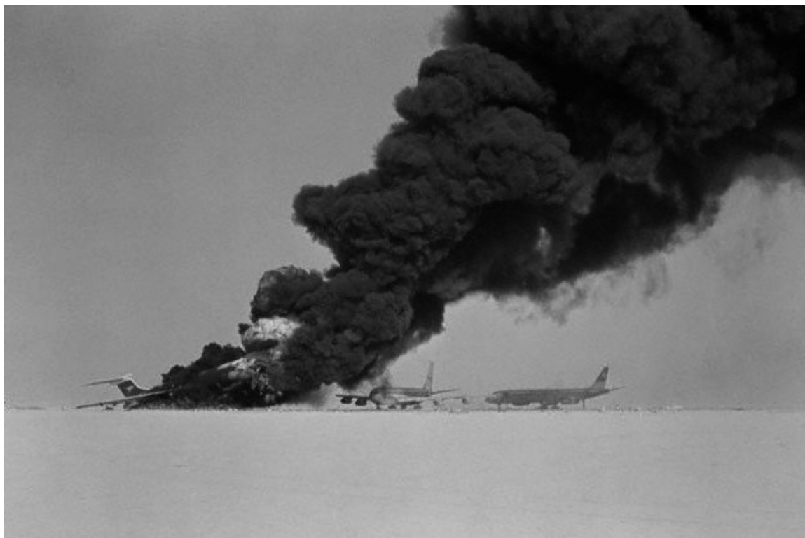
A photograph of a hijacked airliner, Jordan 1970.