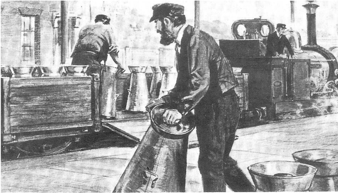
Milk churns being taken by train from farms in the west of England to the City of London.

22 Look at the illustration, and then answer the questions which follow.