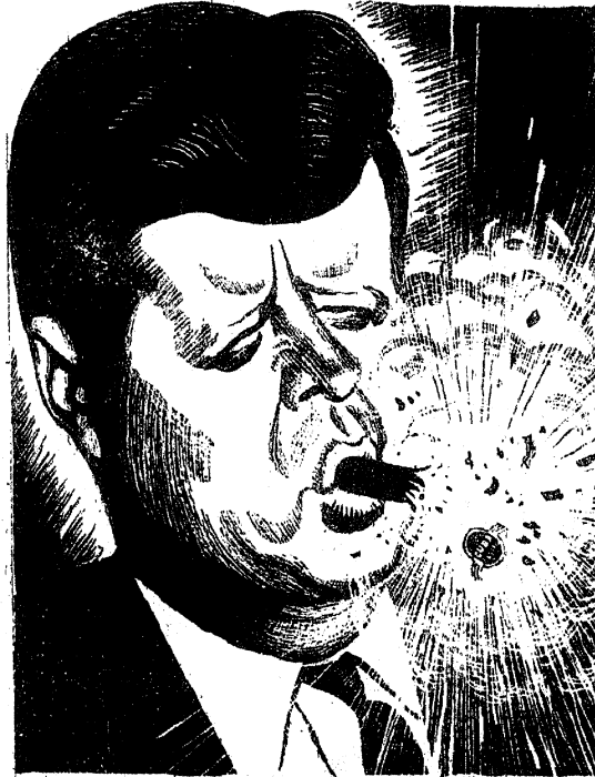
A cartoon published in Britain on 21 April 1961. The cigar represents the Bay of Pigs invasion.