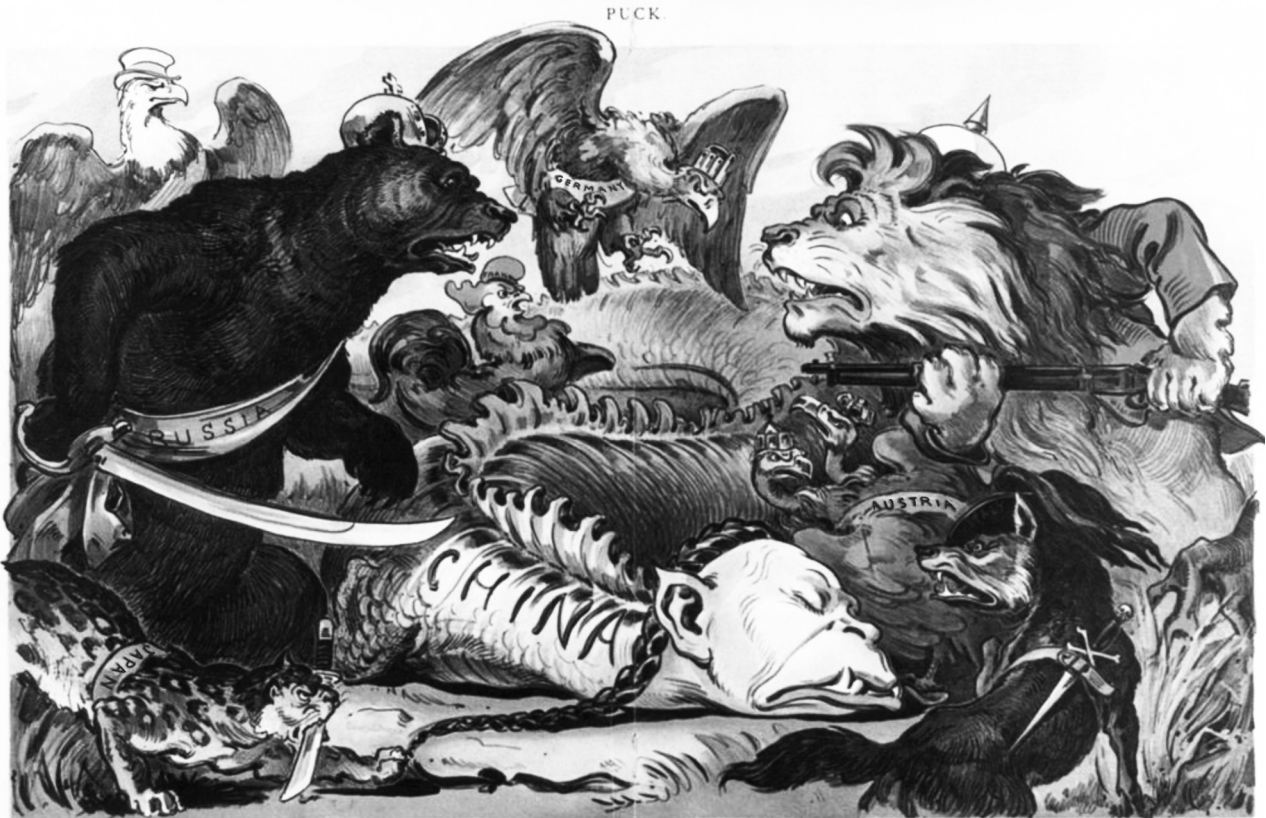
THE REAL TROUBLE WILL COME AFTER THE FUNERAL

Cartoon from an American magazine in the late nineteenth century. The caption beneath says, 'The real trouble will come after the funeral.'