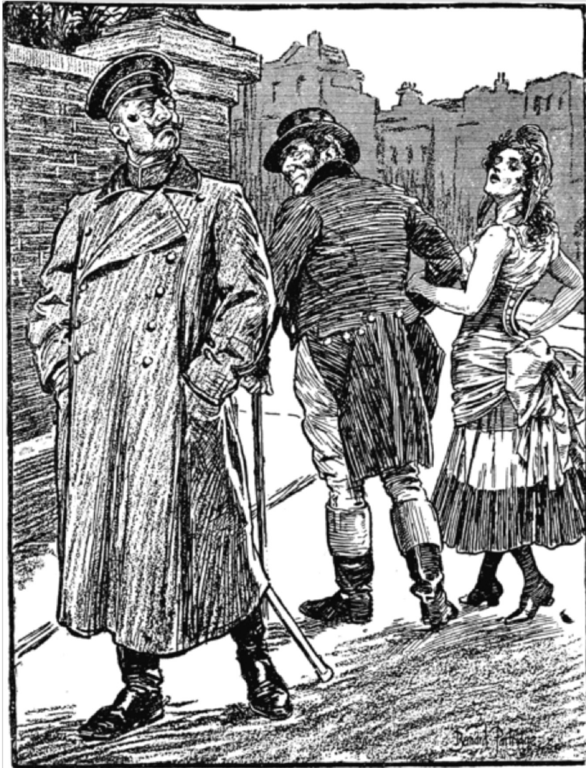
A cartoon published in Britain in 1904. Britain is shown with France.