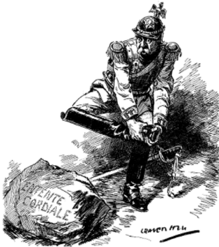
A British cartoon, entitled 'Solid', published in August 1911. The Kaiser is saying 'Donnerwetter! It's rock. I thought it was going to be paper.'