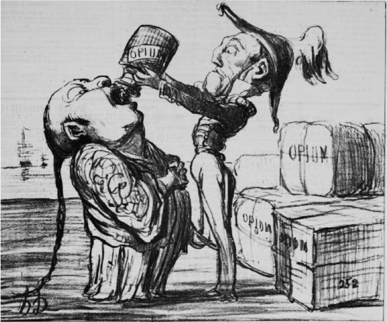
A French cartoon published in 1840. The figure on the right represents Britain.