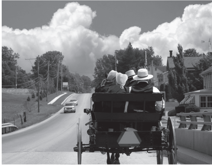
Image of the Amish travelling in a courting buggy on a road in Pennsylvania

The Amish are a religious community in Pennsylvania, USA. Their strict religious beliefs mean they reject some features of modern lifestyles, like the motor car. Individuals who do not conform to the norms of the group can face ostracism by their community. The Amish have become a tourist attraction because their way of life is so different. There can be conflict between them and the tourists as their religion means they are not happy to be photographed.