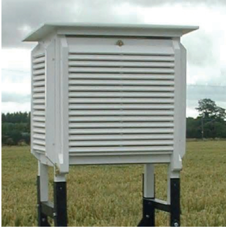
Photograph A for Question 1