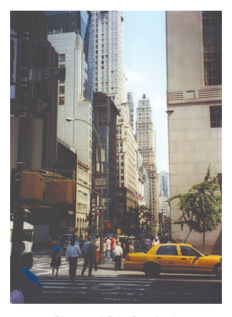
Photograph B for Question 3