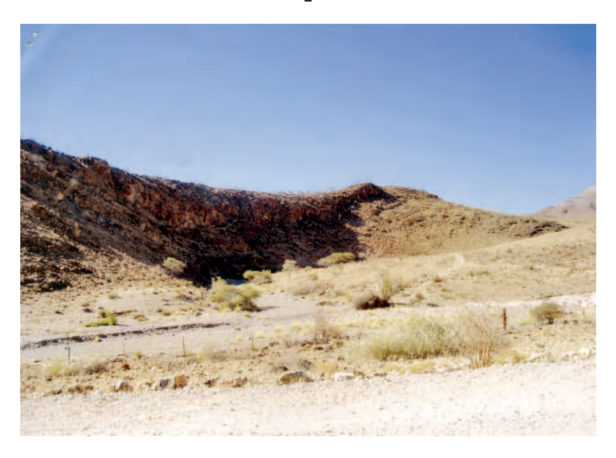
Photograph A for Question 3