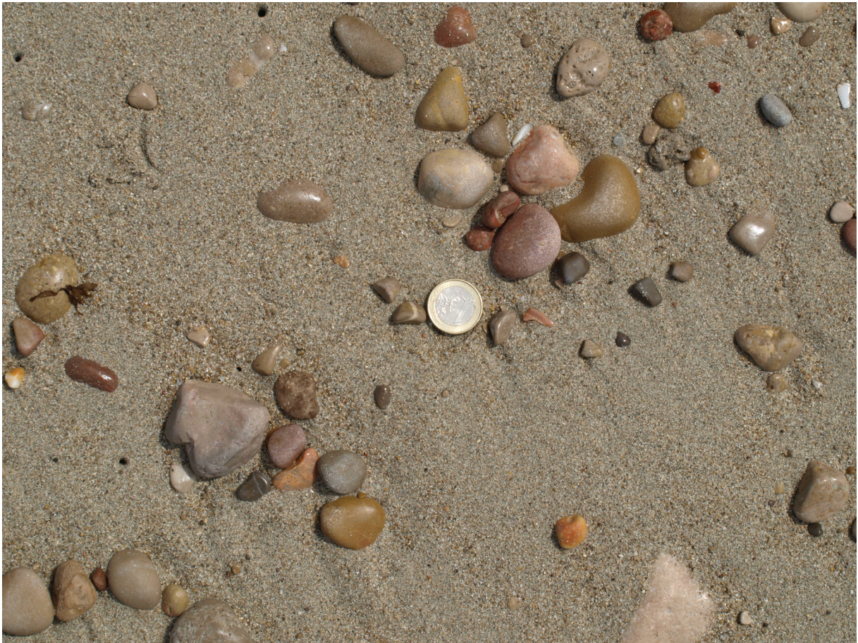
Photograph A for Question 3