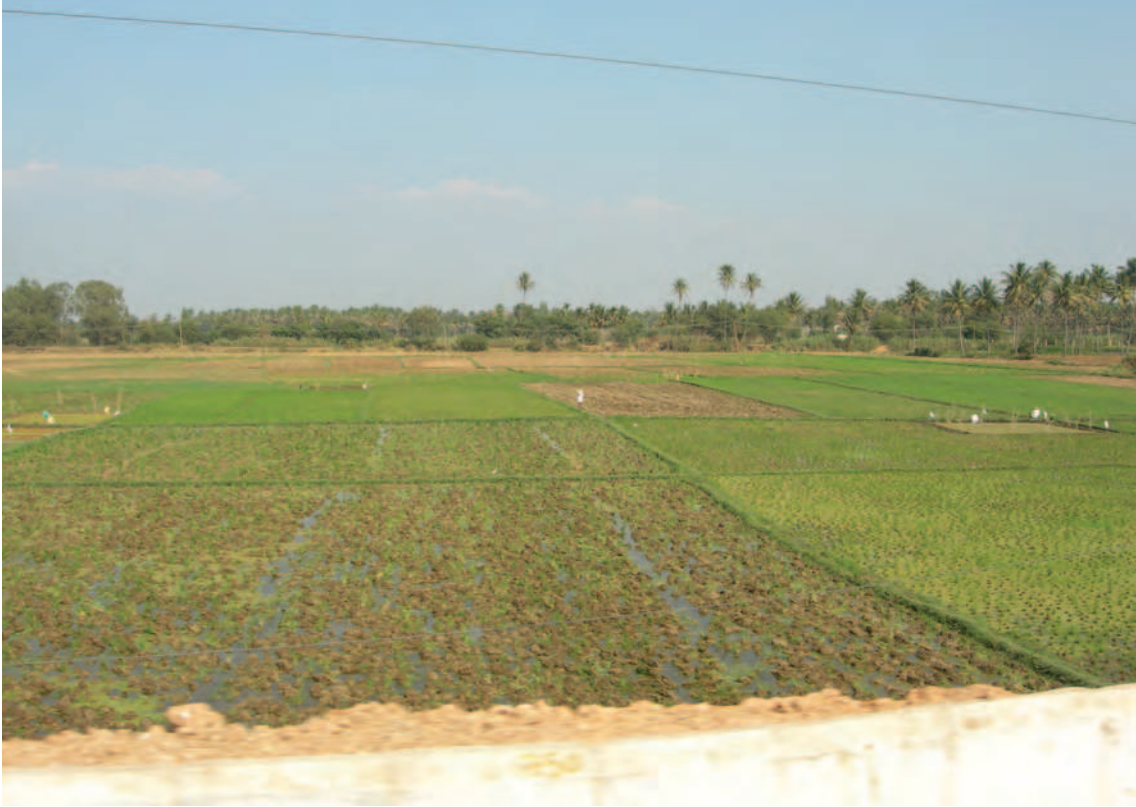
Photograph E for Question 6