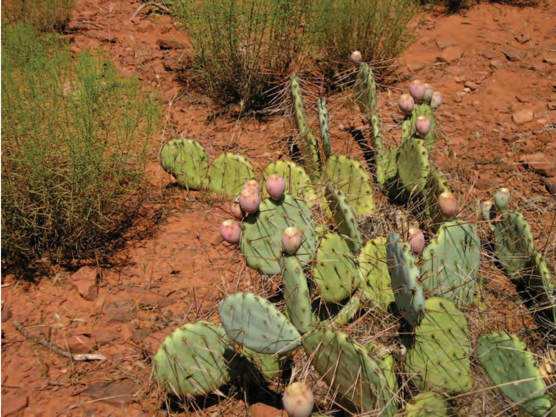
Photograph C for Question 6