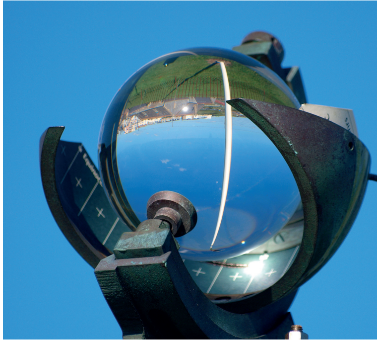
Photograph A for Question 1