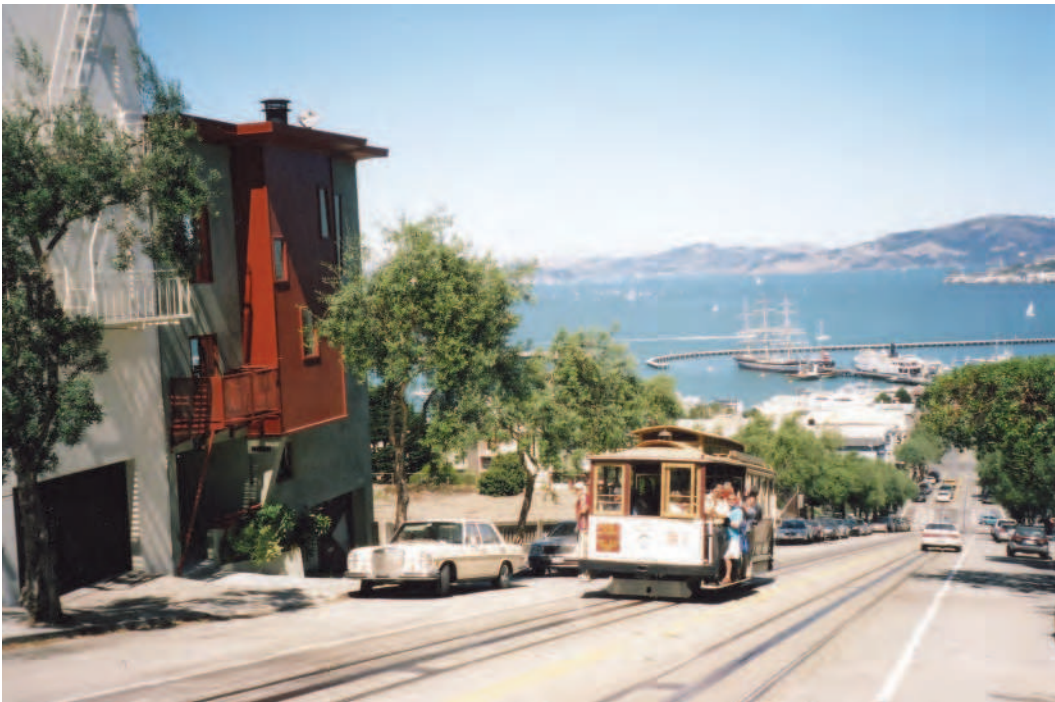
Photograph C for Question 3 is on page 4