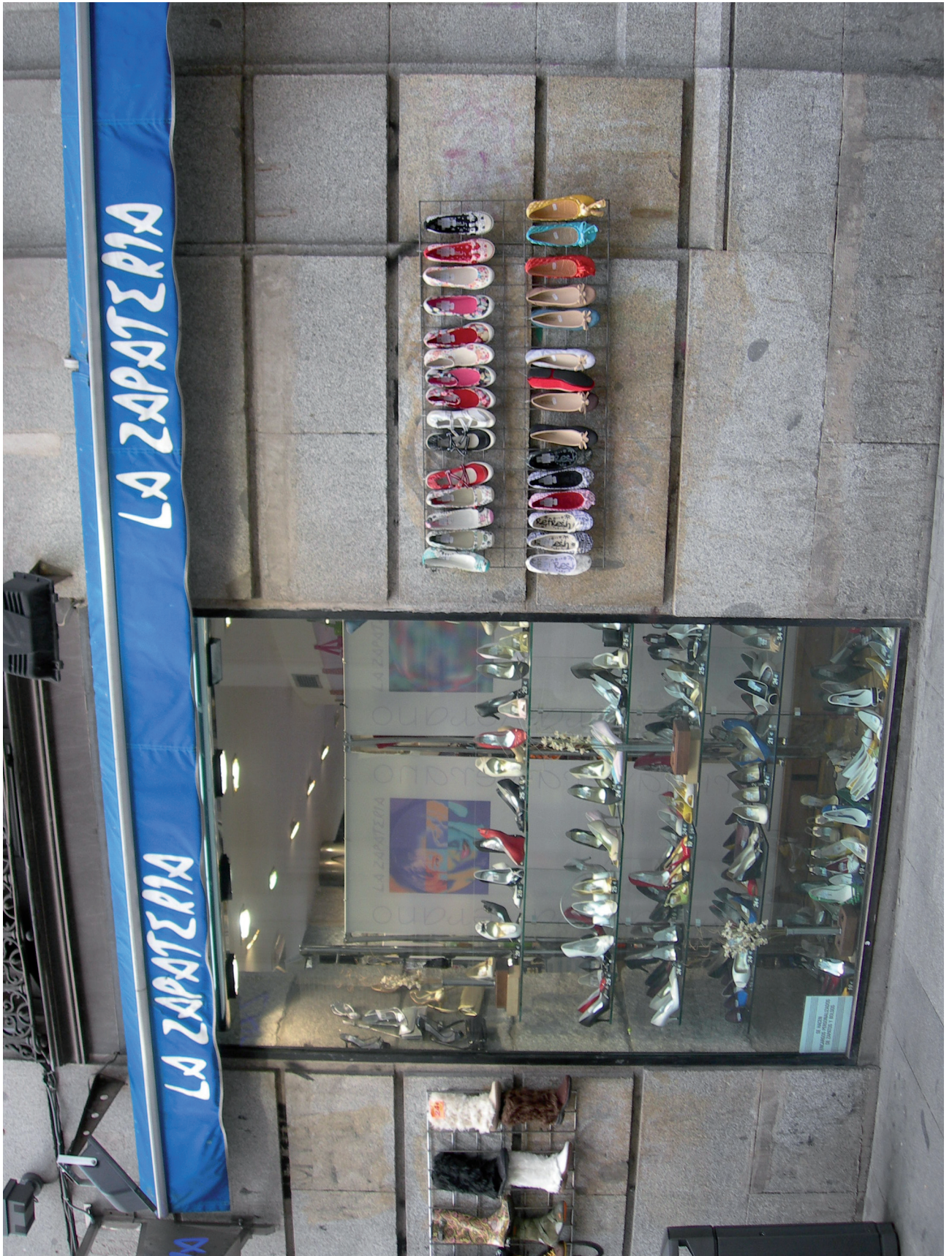
Photograph A for Question 2