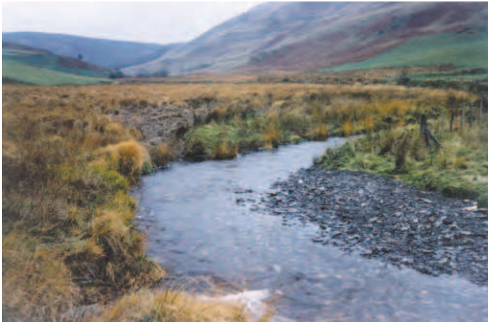
Photograph A for Question 2