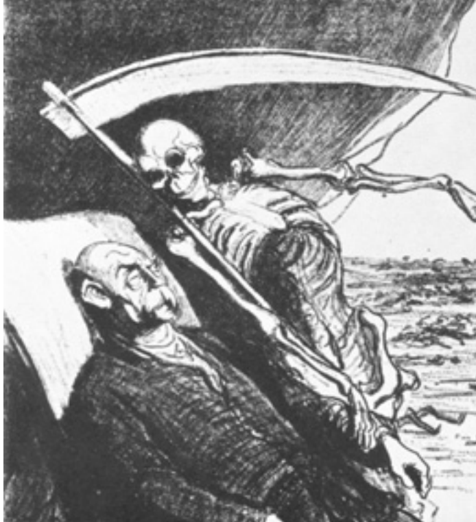
A cartoon showing Death thanking Bismarck for the thousands killed in the course of unification.