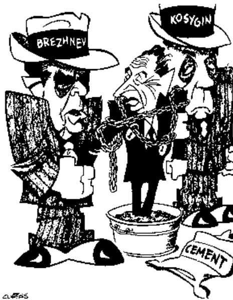
An American cartoon about the Soviet invasion of Czechoslovakia in 1968. It shows Brezhnev and his deputy as gangsters. The man in the middle is Dubček. His feet are being dipped in concrete.