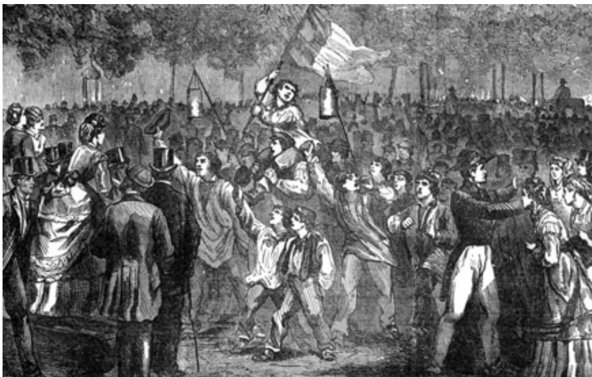
A drawing, from the time, showing French crowds celebrating the declaration of war against Prussia on 19 July 1870.