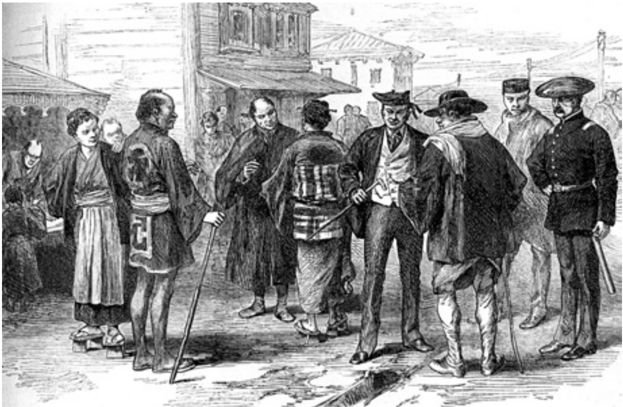
Traditional and western costume in Japan, 1873.