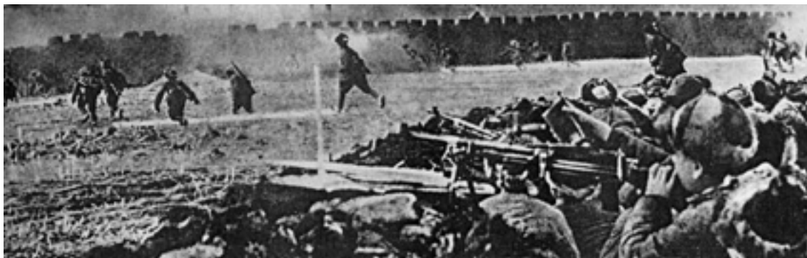
A photograph of Communist troops advancing in the Civil War.

15 Study the photograph, and then answer the questions which follow.