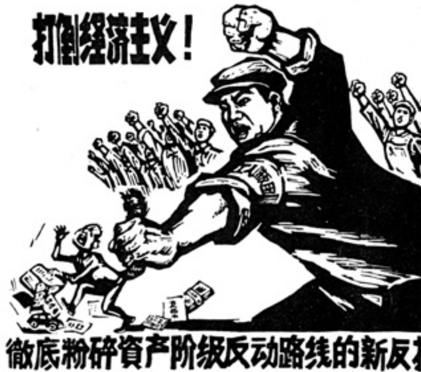
The Red Guards dealing with opponents during the Cultural Revolution.

16 Study the cartoon, and then answer the questions which follow.