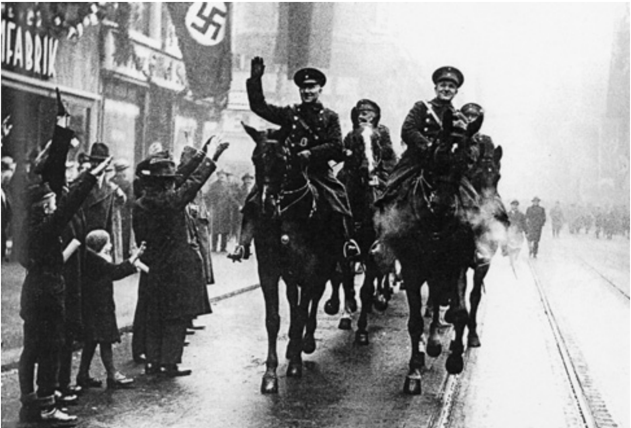
People in the Saar celebrating the results of the 1935 plebiscite.

6 Study the photograph, and then answer the questions which follow.