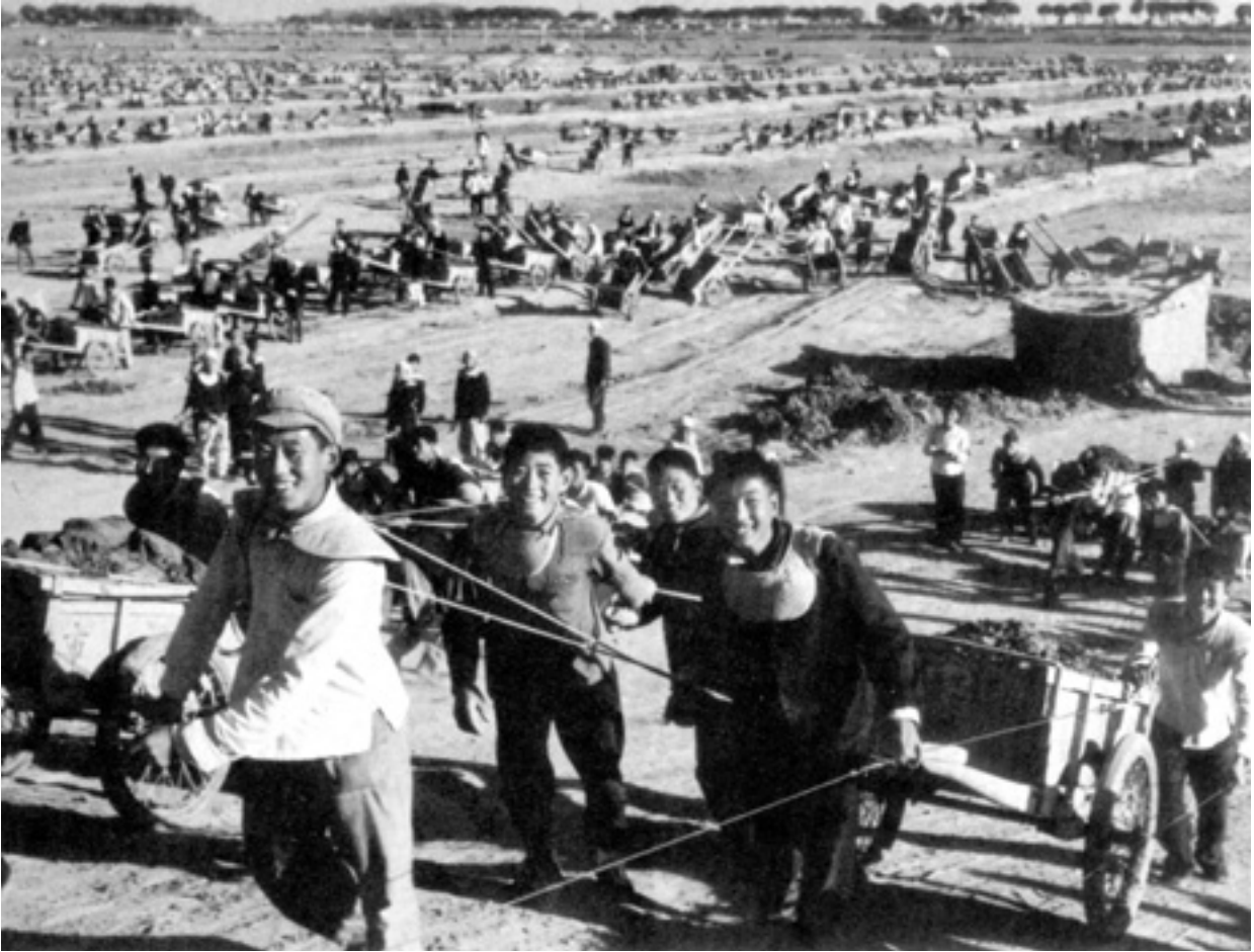
Chinese workers on the Haiho River Project.

15 Study the photograph, and then answer the questions which follow.