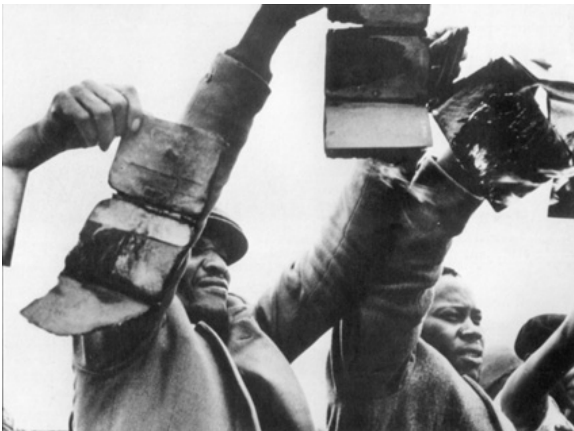
Pass books being burned in South Africa, 1960.

18 Study the photograph, and then answer the questions which follow.