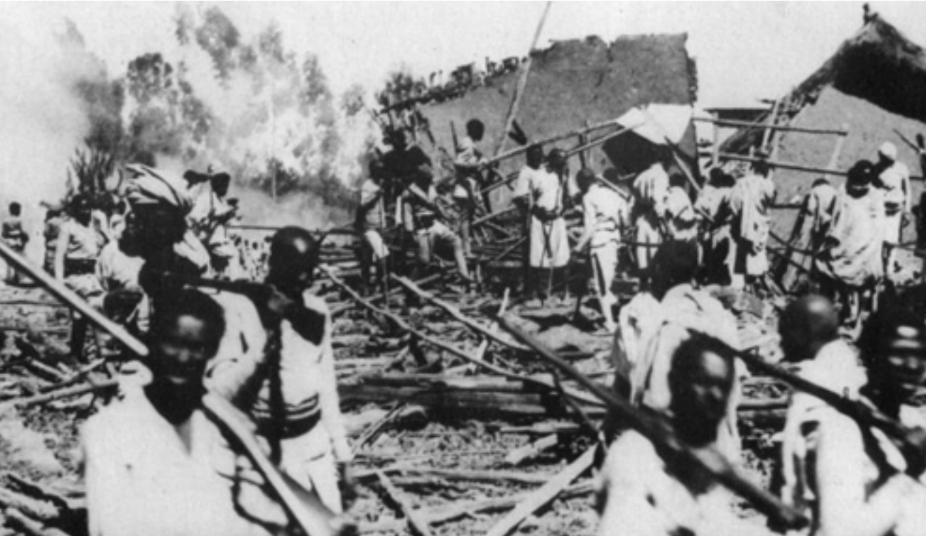
An Abyssinian village bombed by Italian aircraft in the invasion of 1936.

6 Study the photograph, and then answer the questions which follow.