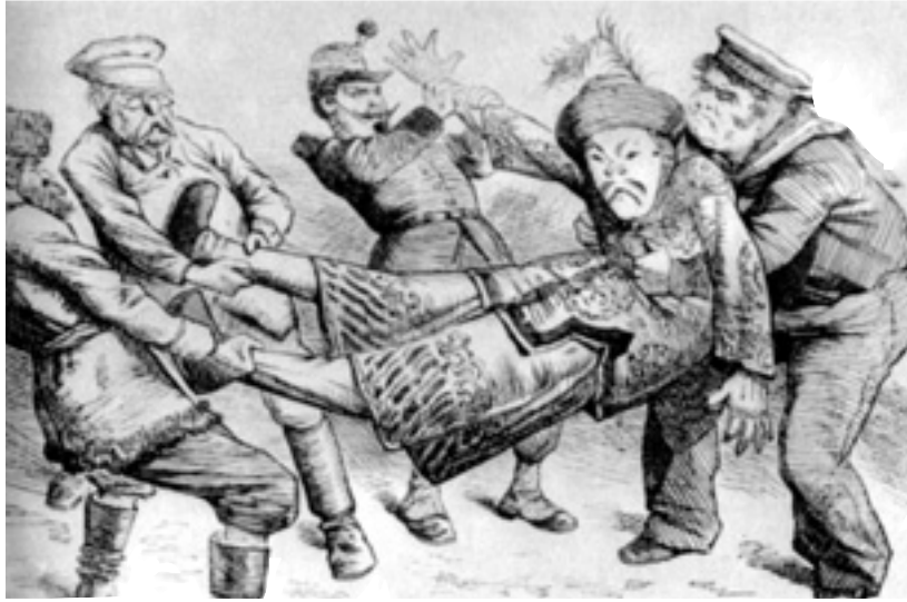
A nineteenth-century cartoon showing China being pulled by several European countries in different directions.

24 Study the cartoon, and then answer the questions which follow.