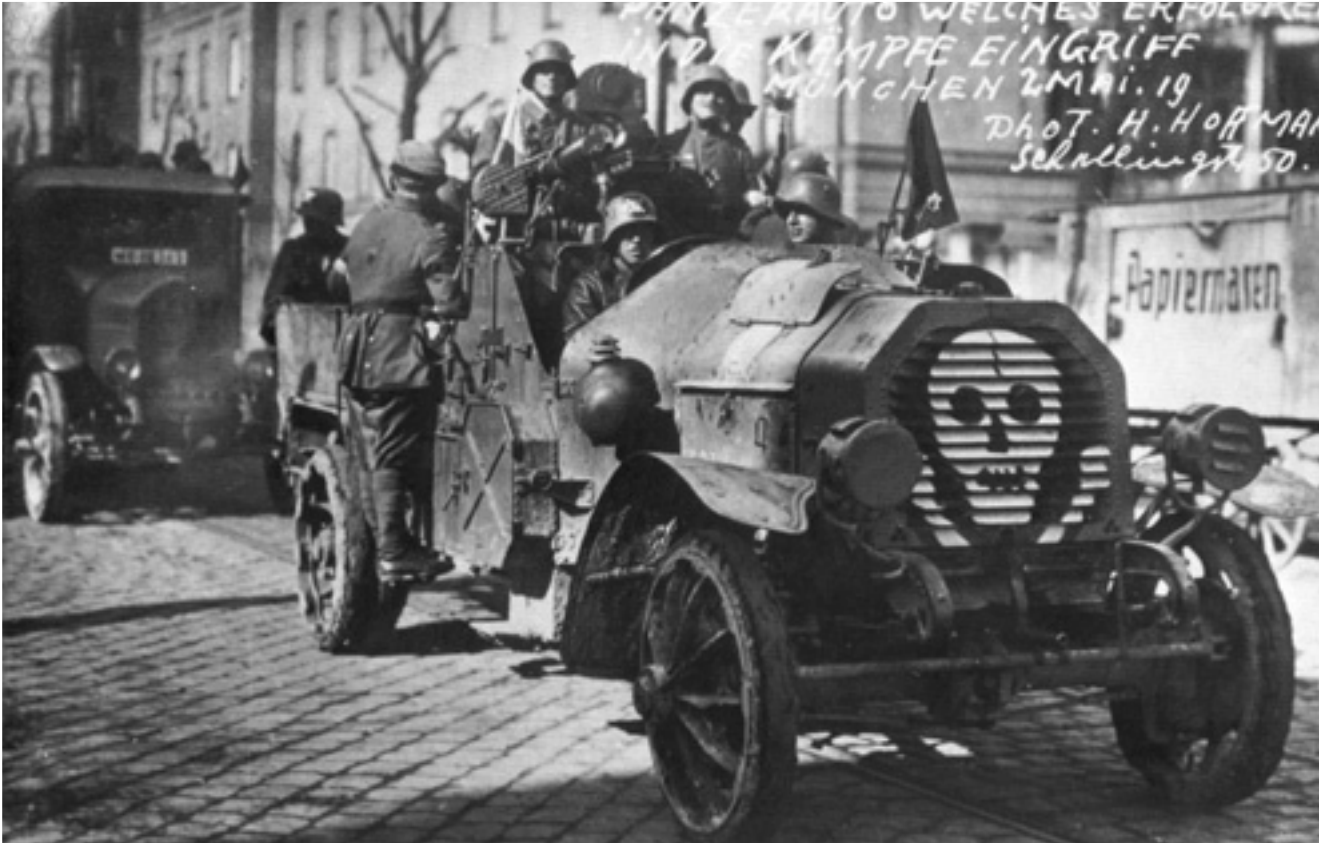
A Freikorps unit in Munich, May 1919.