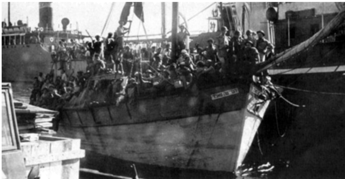
A refugee ship being sent back from Palestine to Cyprus by British soldiers in 1946.

20 Study the photograph, and then answer the questions which follow.