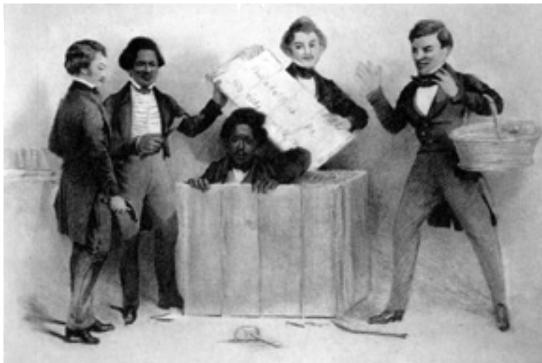
The escape of a slave from Richmond, Virginia to Philadelphia in the North.