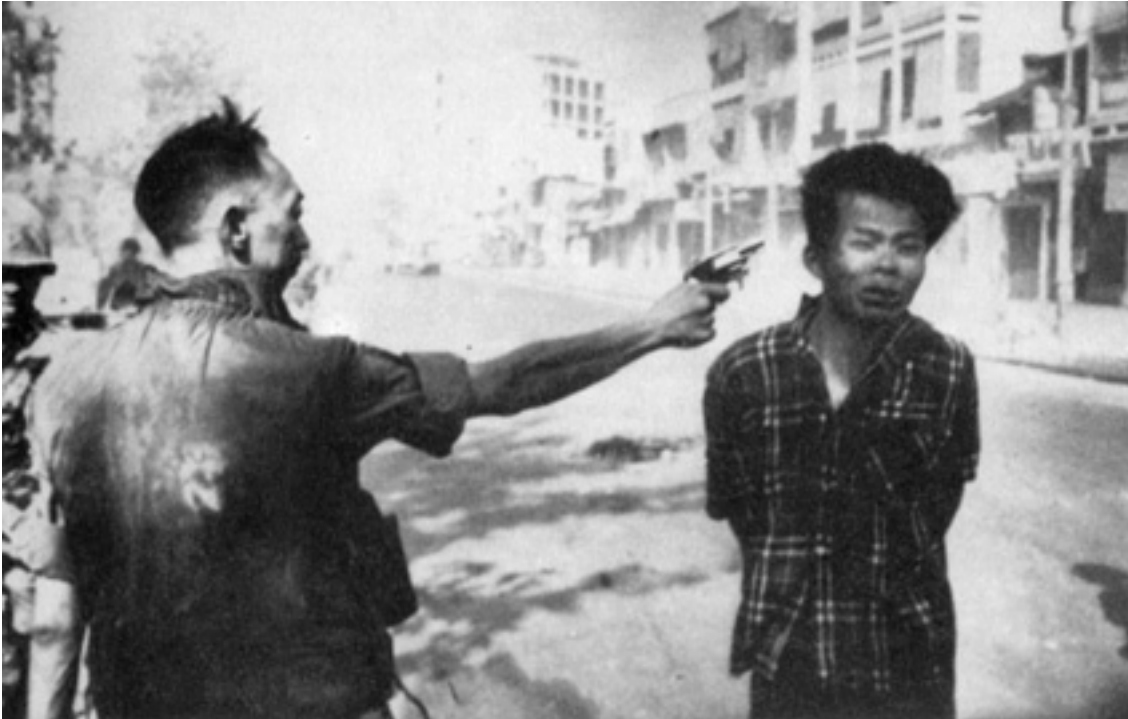
The execution of a Vietcong suspect during the Tet offensive, 1968.

7 Study the photograph, and then answer the questions which follow.