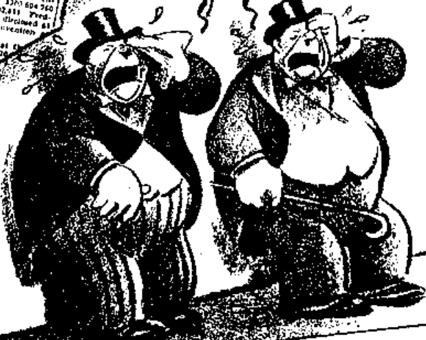
A cartoon published in a US newspaper in 1936.

Preliminary Report for 1935 Shows Equivalent of $4.59 a Share on Preferred. TOP PROFIT SINCE 1930