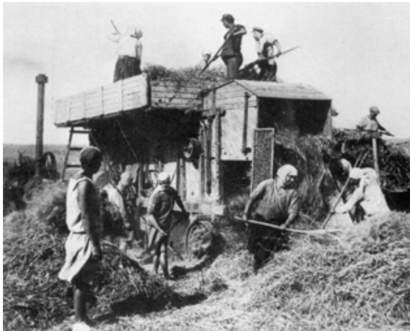
Threshing on a collective farm.

12 Study the photograph, and then answer the questions which follow.