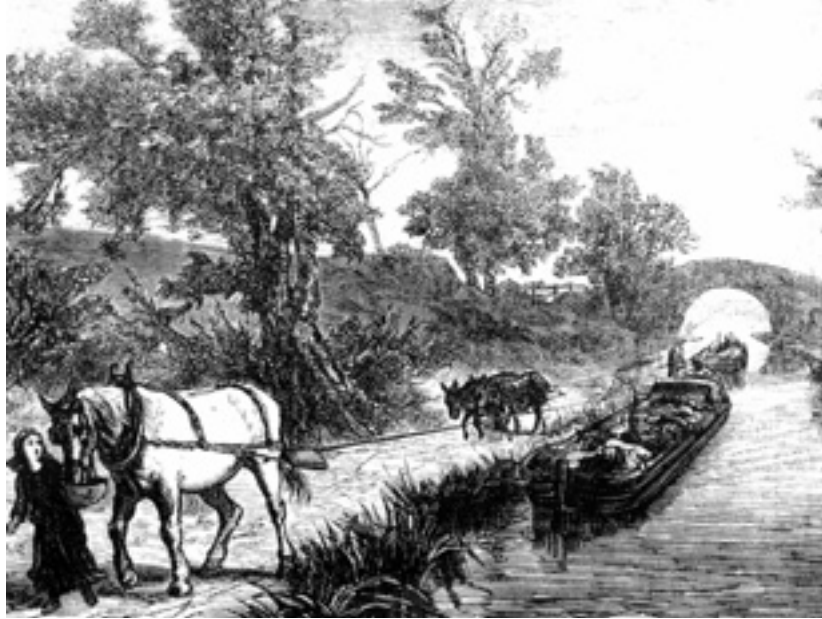
An early nineteenth-century drawing of canal barges.

22 Study the picture, and then answer the questions which follow.