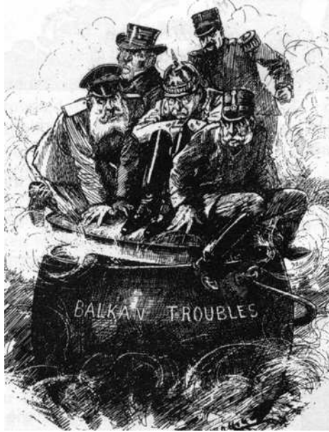
A British cartoon entitled 'The Boiling Point', published in 1912. The figures represent the five Great Powers.