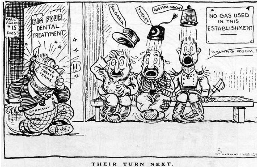
A cartoon from a British newspaper, May 1919. It shows the waiting room of a dentist.