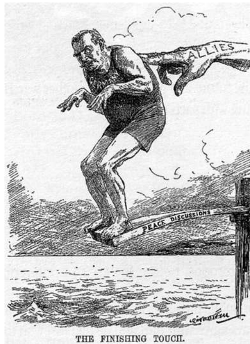
A cartoon published in Britain in 1919.