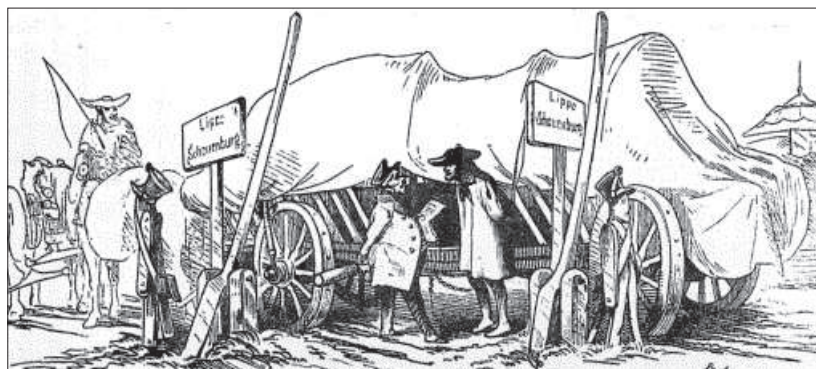
A German cartoon showing the collection of customs duties in 1834.