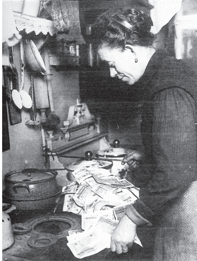
A woman using banknotes to start her fire in 1923.