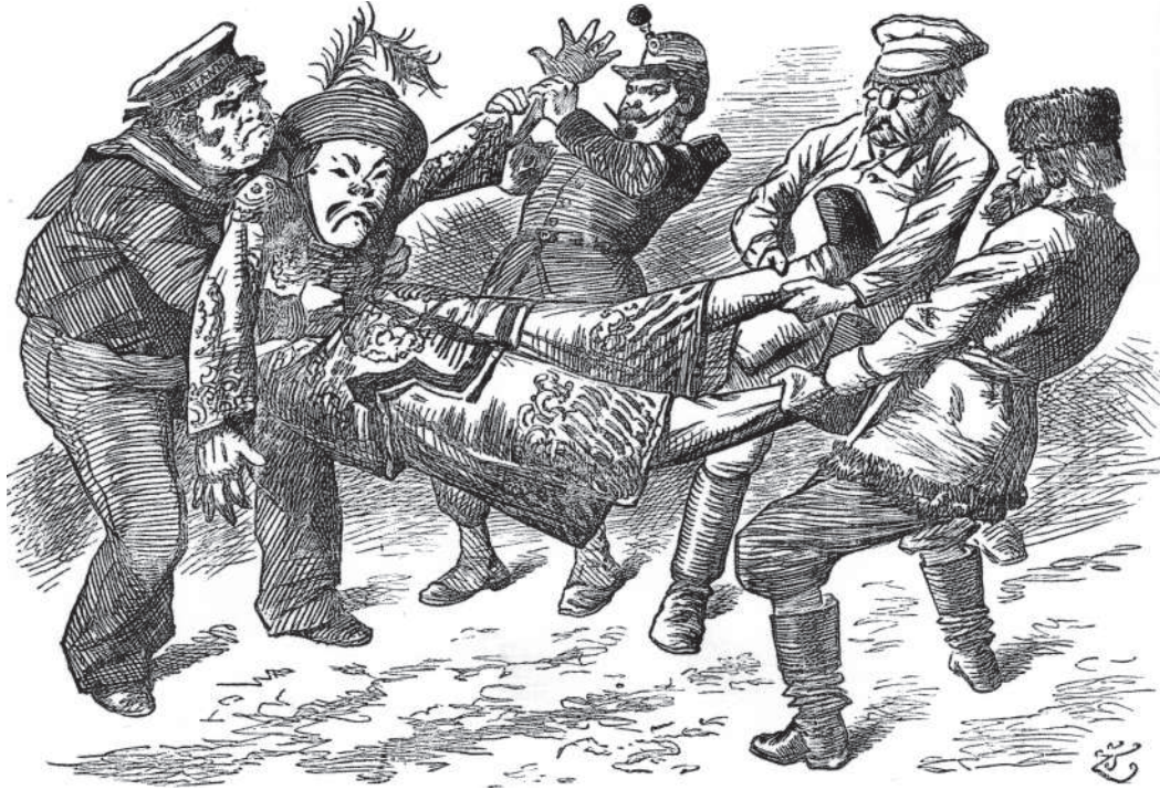
A cartoon showing foreign countries competing over China.

24 Study the cartoon, and then answer the questions which follow.