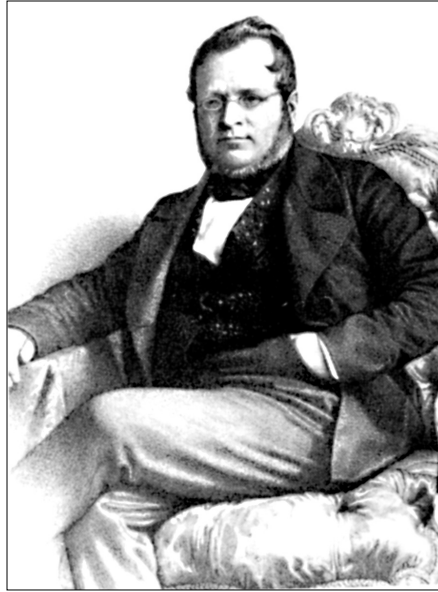
A painting of Cavour.