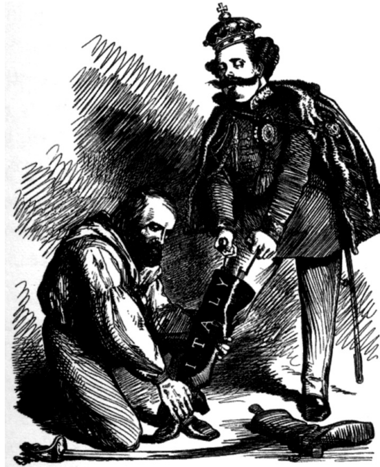
RIGHT LEG IN THE BOOT AT LAST.

“IF IT WON’T GO ON, SIRE, TRY A LITTLE MORE POWDER.”