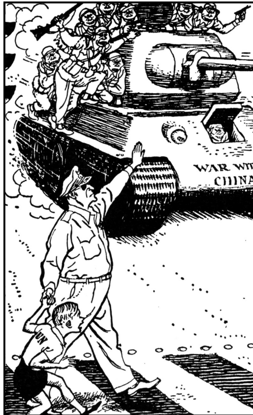
A cartoon from a British newspaper, November 1950. It shows General MacArthur ordering a South Korean tank to stop.