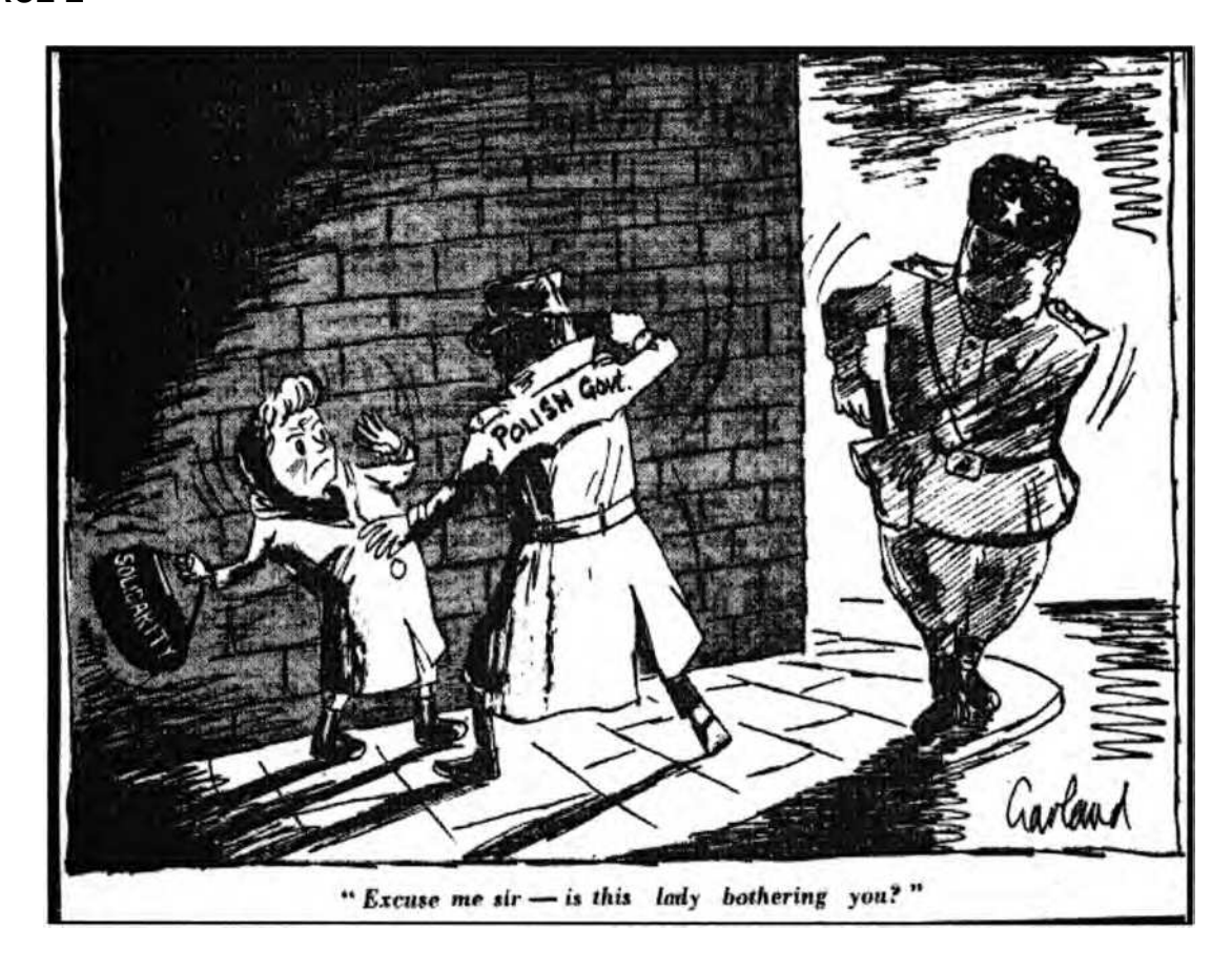
A cartoon published in an English newspaper in December 1980. The Russian soldier is saying 'Excuse me sir - is this lady bothering you?'.