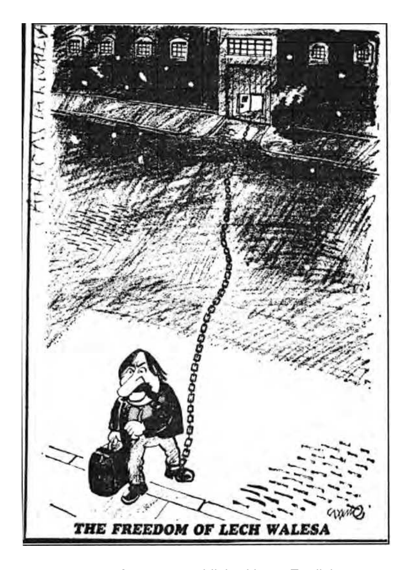
A cartoon published in an English newspaper in November 1982.