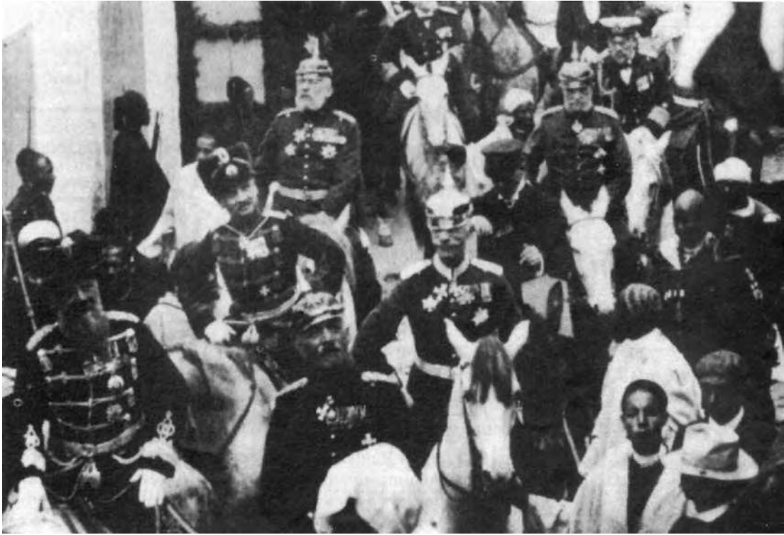
Kaiser Wilhelm II riding through Tangier in 1905.