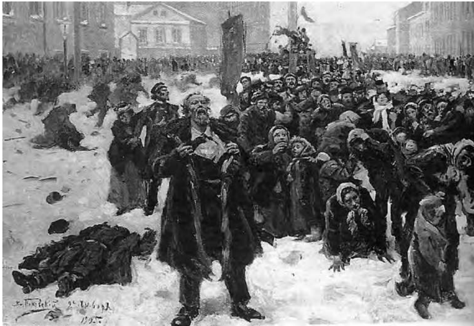
A painting of Bloody Sunday, produced around 1910.

11 Study the painting, and then answer the questions which follow.