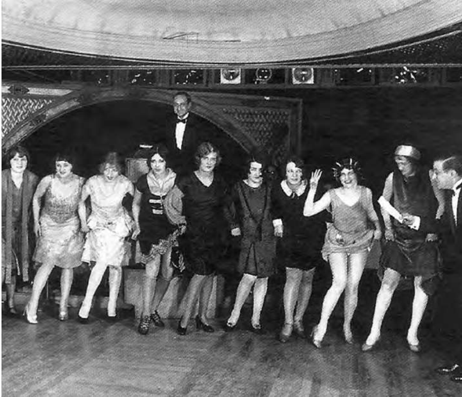
Flappers in the 1920s.

13 Study the photograph, and then answer the questions which follow.