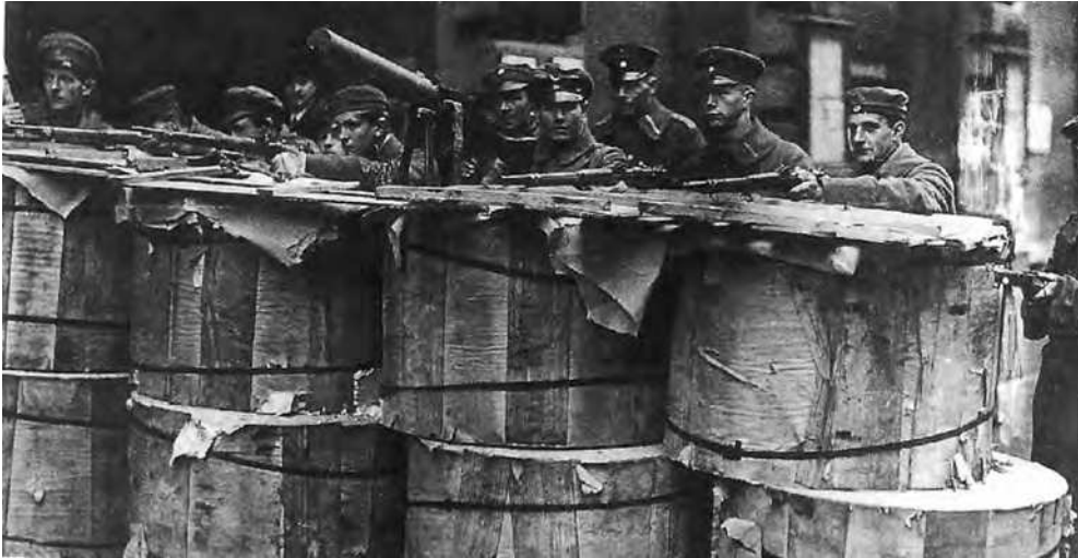
Spartacists defending the captured newspaper offices, 1919.