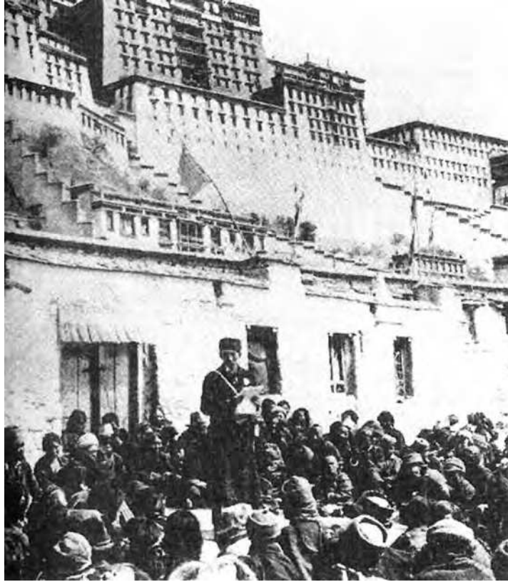
A Chinese Communist leader reads a proclamation to crowds of Tibetans in 1959.

15 Study the picture, and then answer the questions which follow.