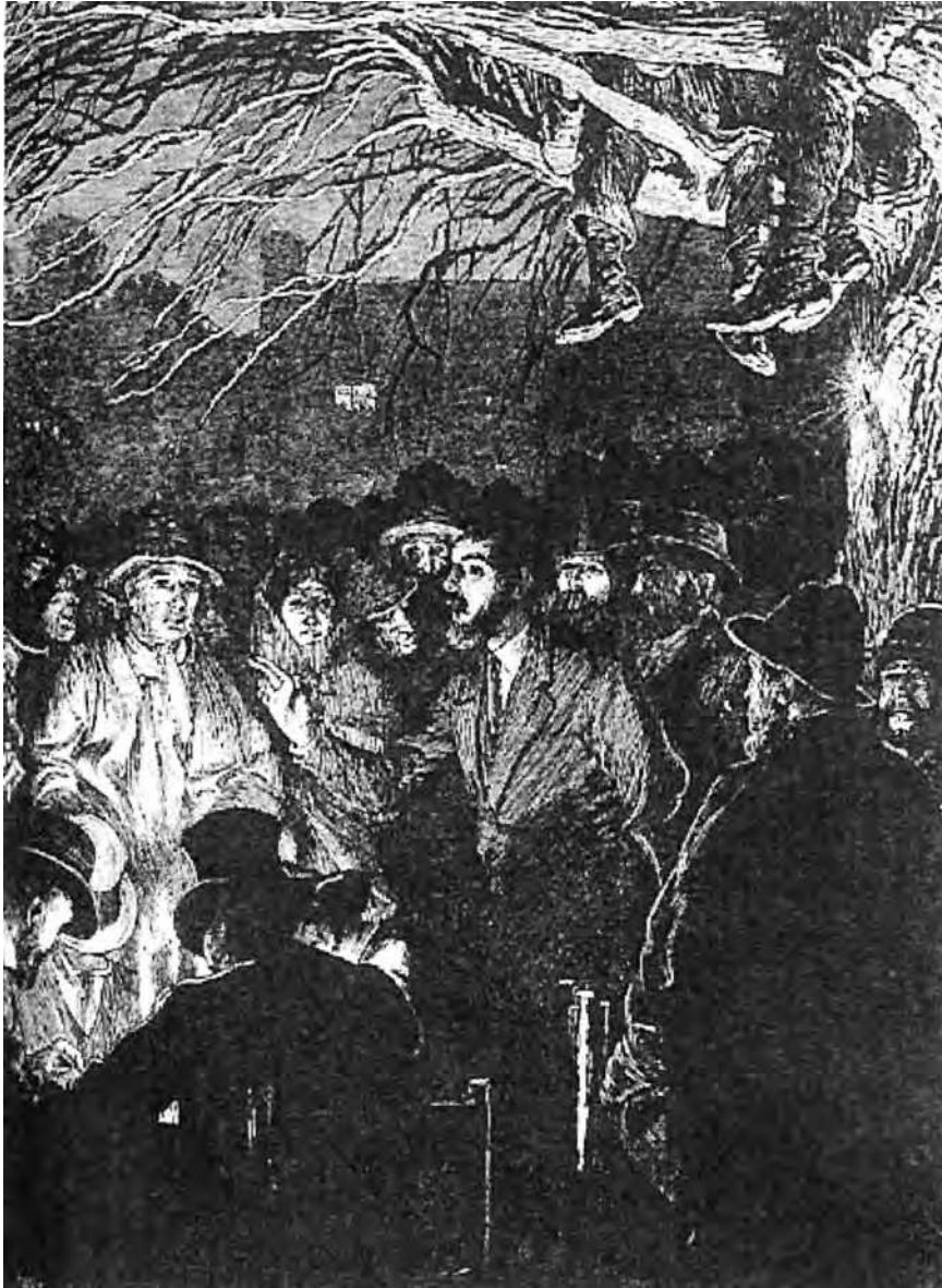
Joseph Arch speaking to members of the National Agricultural Labourers' Union in the 1870s. The meeting was held at night for fear of victimisation by landowners.

23 Study the illustration, and then answer the questions which follow.