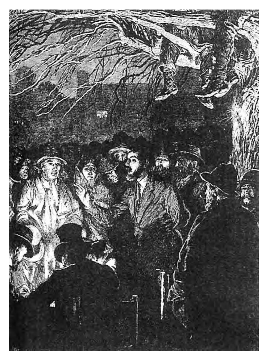
Joseph Arch speaking to members of the National Agricultural Labourers' Union in the 1870s. The meeting was held at night for fear of victimisation by landowners.

23 Study the illustration, and then answer the questions which follow.