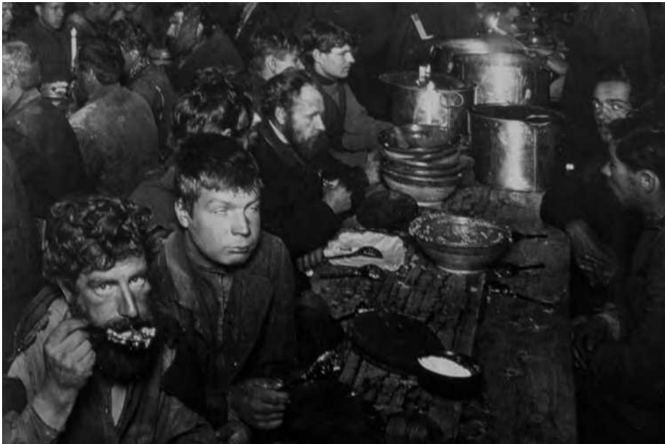
A boarding house for industrial workers, Moscow 1911.

11 Study the photograph, and then answer the questions which follow.