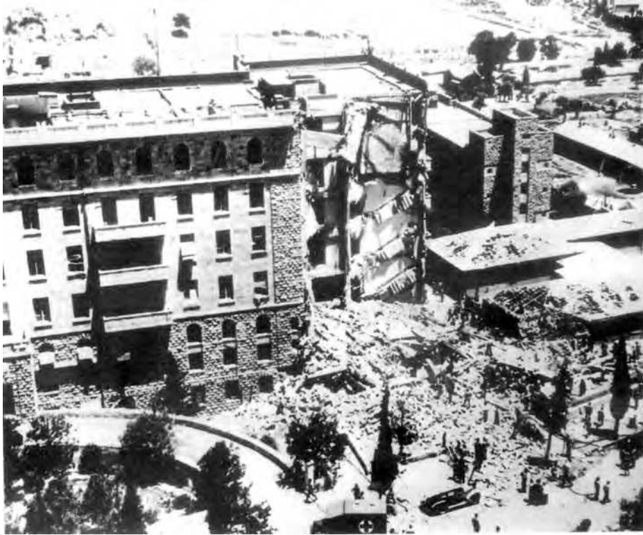
The King David Hotel in Jerusalem following a terrorist attack, 1946.

20 Study the photograph, and then answer the questions which follow.