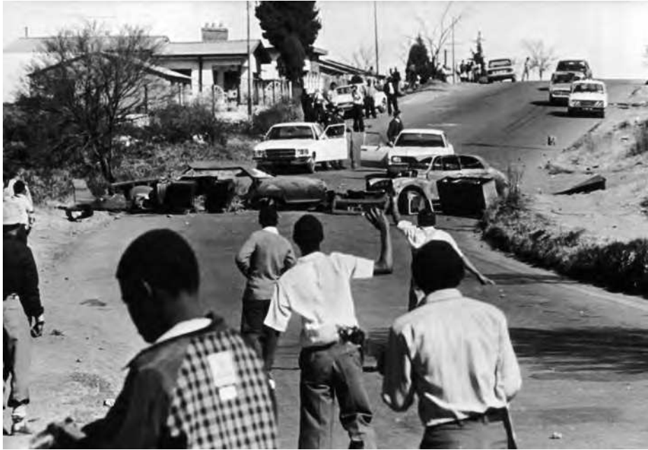
High school students on the streets of Soweto, 1976.

18 Study the photograph, and then answer the questions which follow.