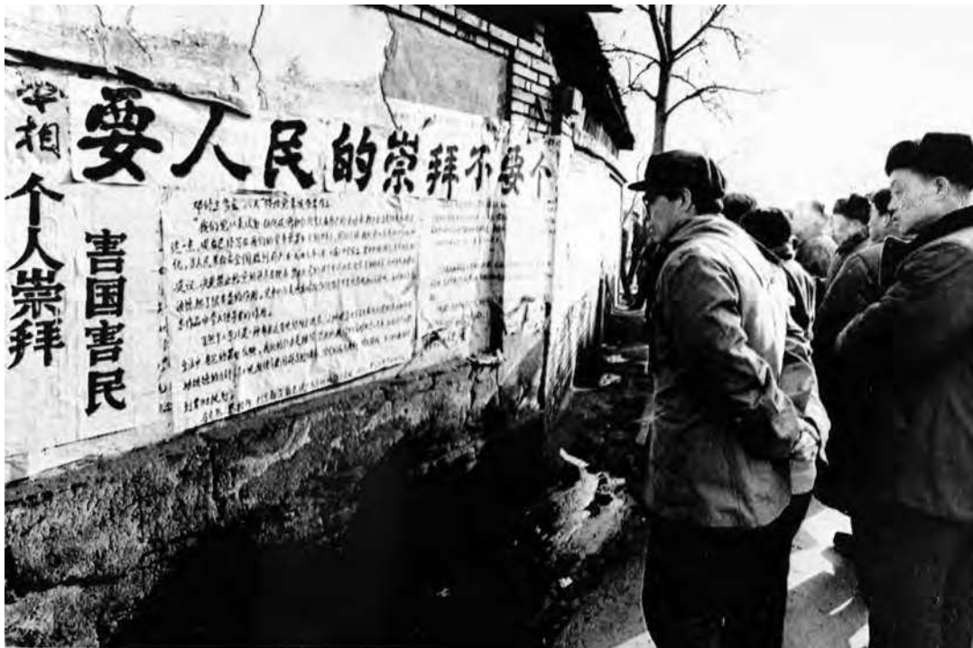
The 'Democracy Wall' in Beijing, 1979.

16 Study the photograph, and then answer the questions which follow.