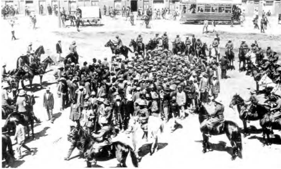
Anti-pass demonstrators being arrested in Johannesburg, 1919.

17 Study the photograph, and then answer the questions which follow.