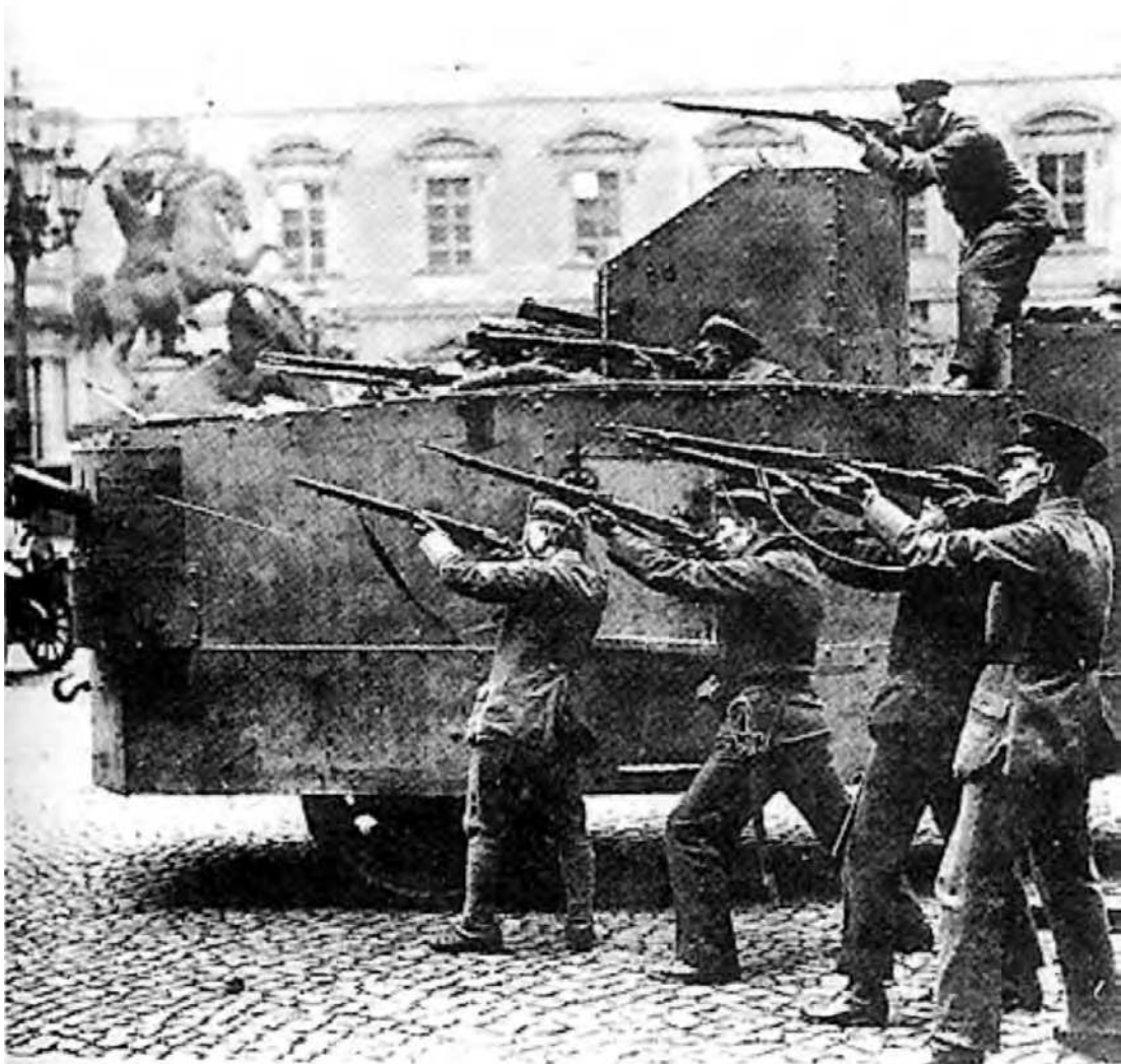
The Freikorps in action in 1919.