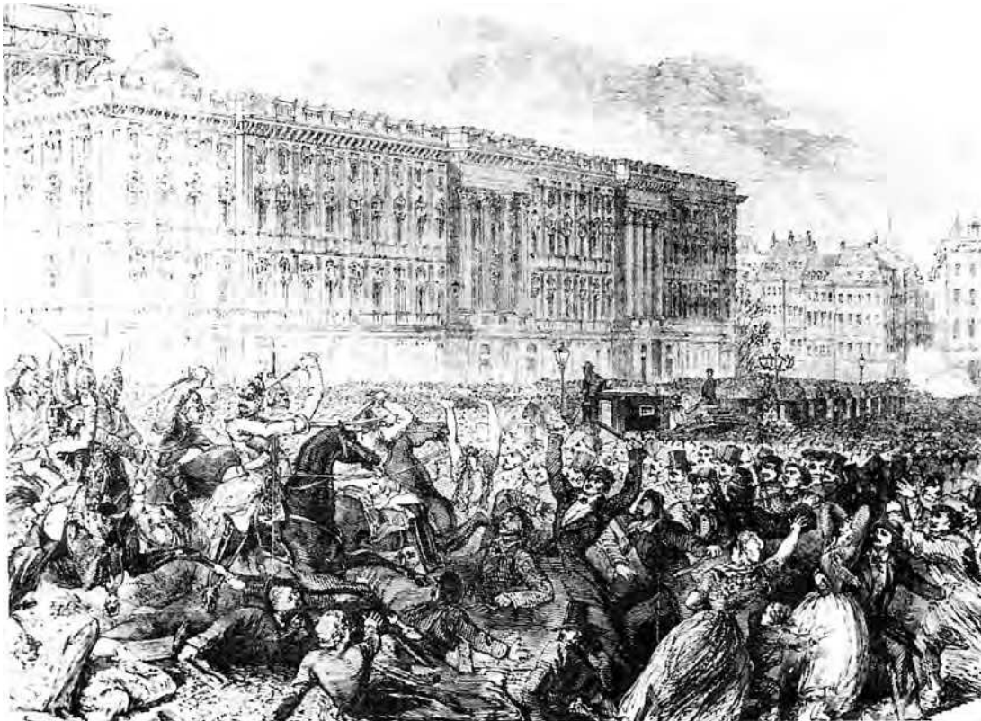
A picture showing the Prussian cavalry charging rioters in front of the Royal Palace in Berlin in 1848.