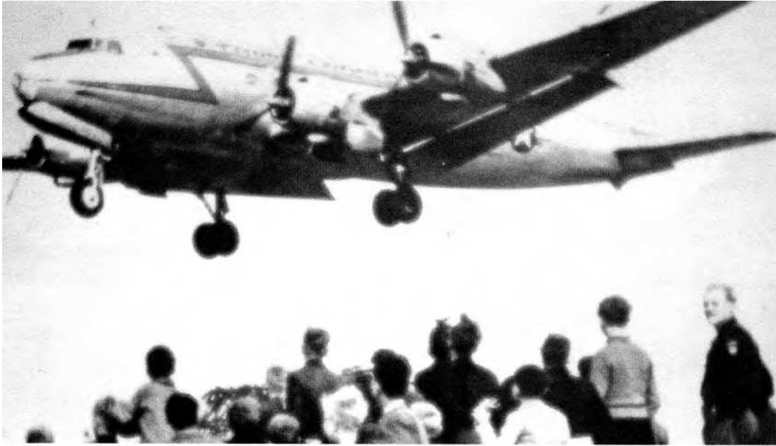
West Berliners watching a US cargo plane landing.

7 Study the photograph, and then answer the questions which follow.