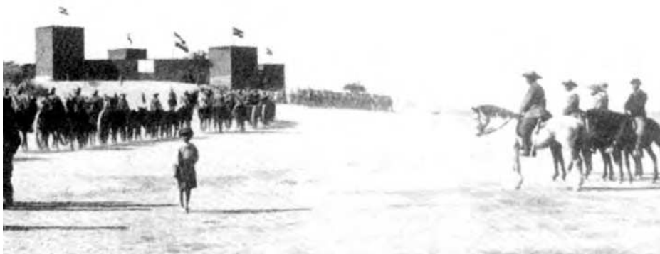
The German fort at Windhoek, 1898.

19 Study the photograph, and then answer the questions which follow.