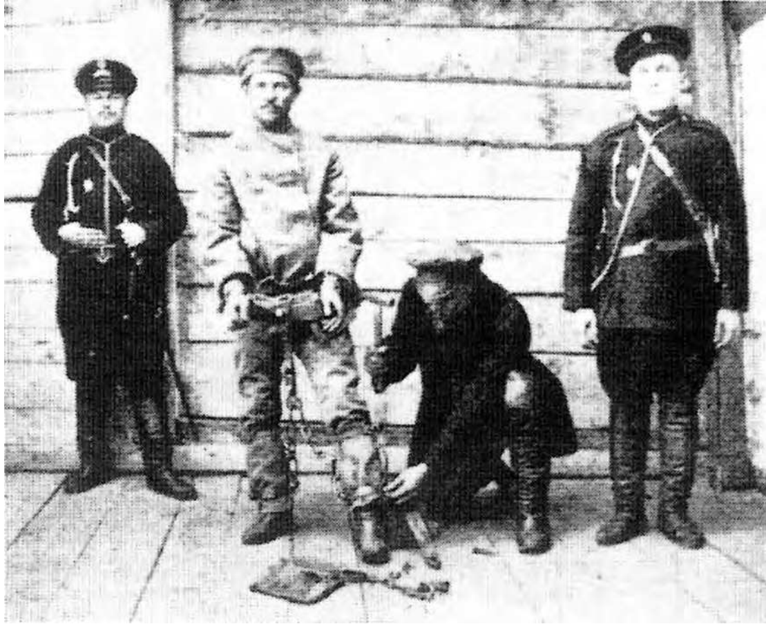
A prisoner of the Okhrana.

11 Study the photograph, and then answer the questions which follow.