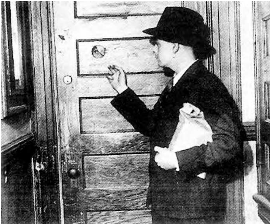
An American visiting a speakeasy.

13 Study the photograph, and then answer the questions which follow.