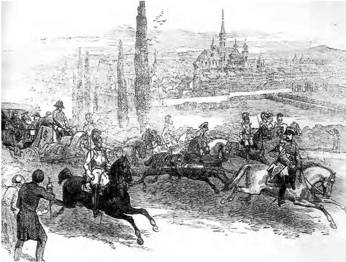
The Emperor of Austria abandoning Vienna and heading to Innsbruck, May 1848.