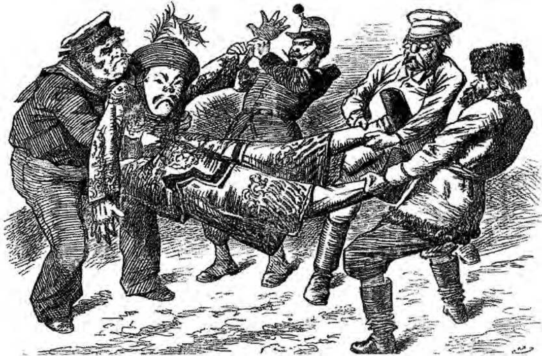
A nineteenth-century cartoon showing China being pulled in different directions by several European countries.

24 Study the cartoon, and then answer the questions which follow.