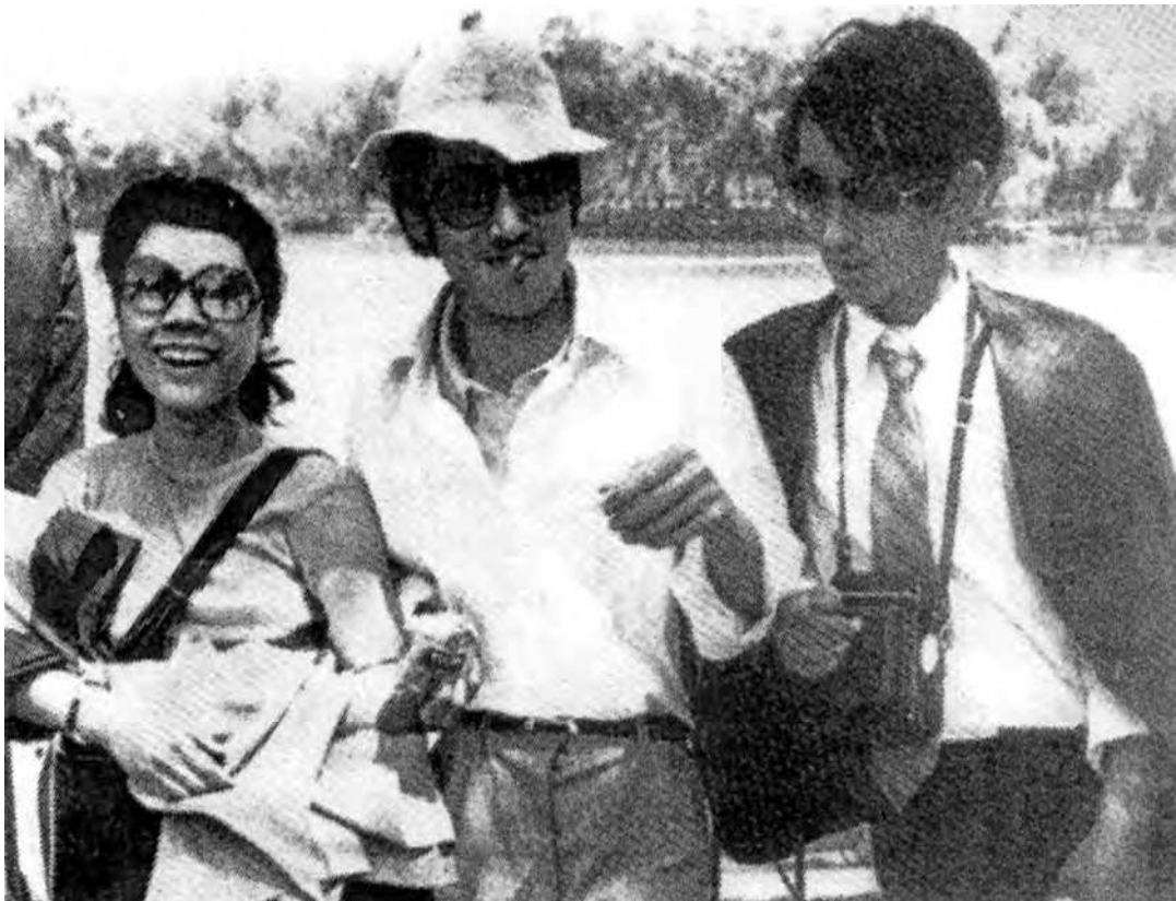
Young Chinese people on the streets of Beijing in the 1980s.

16 Study the photograph, and then answer the questions which follow.