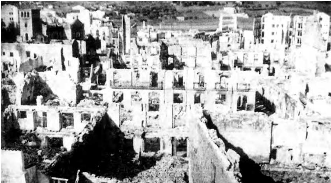
A photograph of Guernica after being attacked by German bombers in 1937.