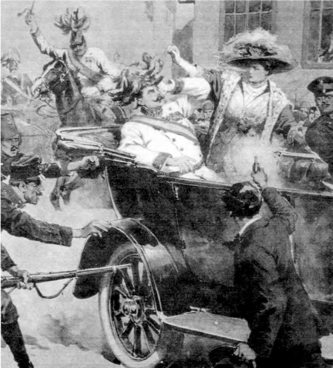
An illustration of the assassination of Franz Ferdinand and his wife in Sarajevo, June 1914.

4 Study the illustration, and then answer the questions which follow.