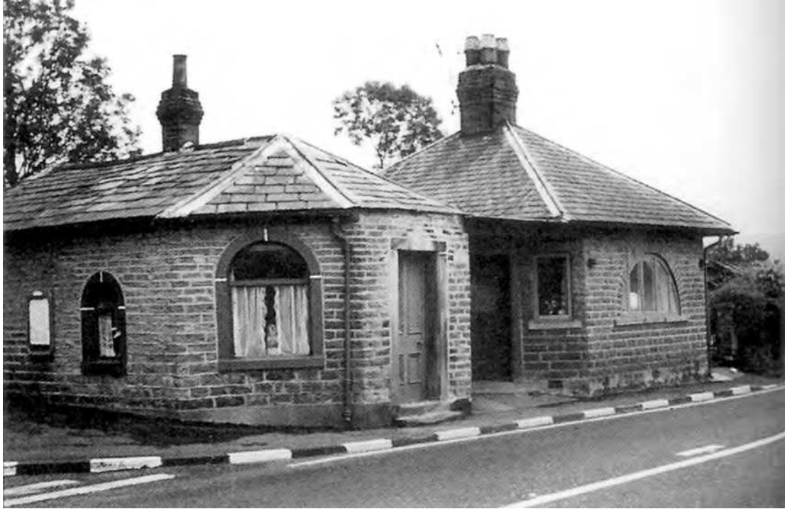
A picture of an eighteenth-century toll-house.

22 Study the photograph, and answer the questions which follow.